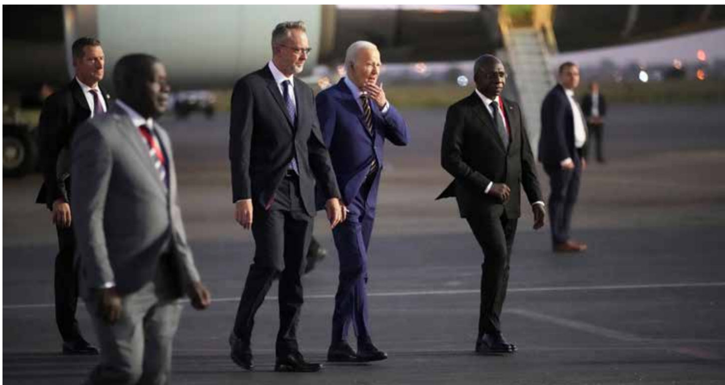
President Joe Biden is greeted by Angolan Foreign Minister Tete Antonio as he arrives at Quatro de Fevereiro international airport in the capital Luanda