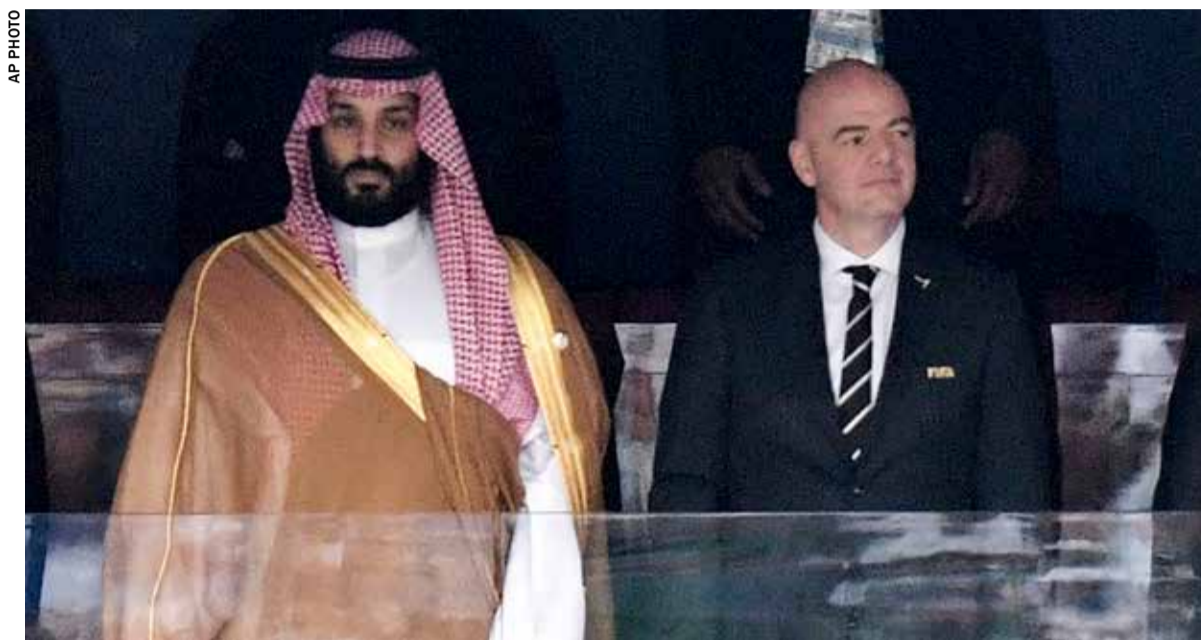
Saudi Arabia Crown Prince Mohammed bin Salman (left) and FIFA President Gianni Infantino (Moscow, 2018)

The close ties between FIFA president Gianni Infantino and Saudi Crown Prince Mohammed bin Salman were built since 2018 amid global criticism of the kingdom's record on human rights, including for women, migrant workers and freedom of expression.