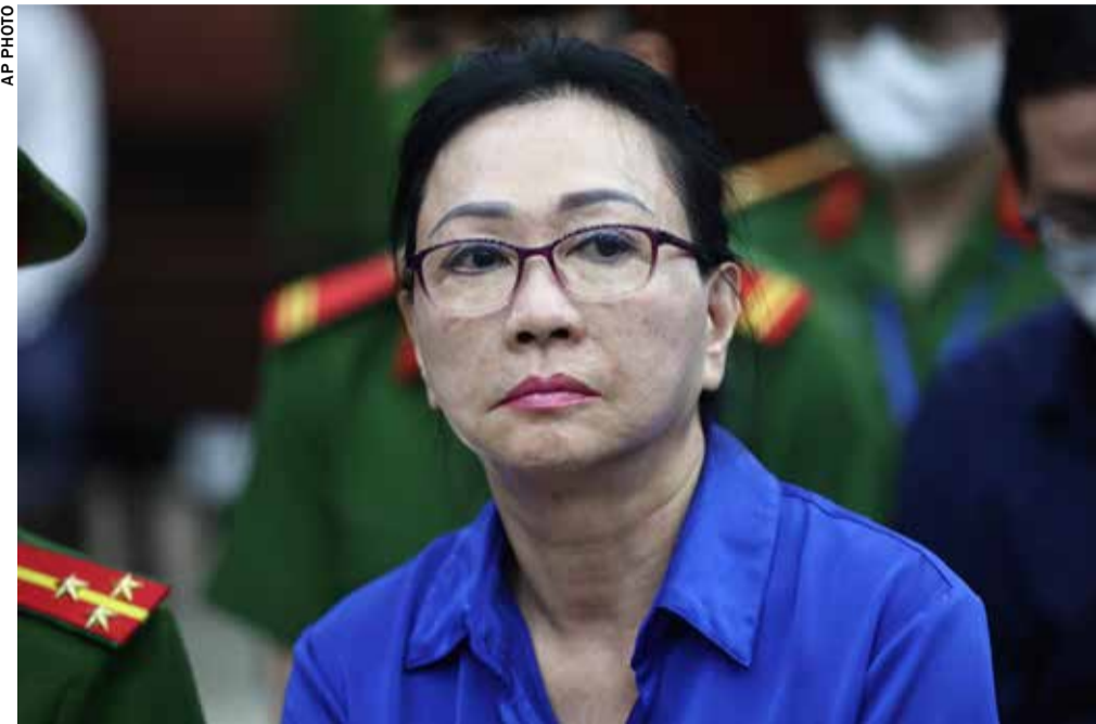
Vietnamese real estate tycoon Truong My Lan attends trial in an appeal she filed against her death sentence in a financial fraud case in Ho Chi Minh City

The Cambodia case was unusual because surrogates normally are employed in their own countries, not transported elsewhere.