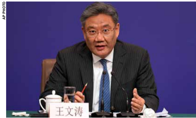
Commerce Minister Wang Wentao

The ratcheting up of trade restrictions comes as President-elect Donald Trump has been threatening to sharply raise tariffs on imports from China and other countries, potentially in-