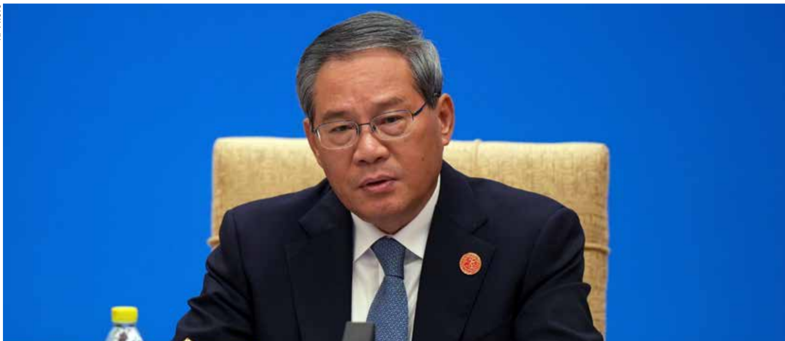
Chinese Premier Li Qiang speaks as he chairs the "1+10" Dialogue on Building Consensus on Development to Promote Global Common Prosperity, at the Diaoyutai State Guesthouse in Beijing, yesterday