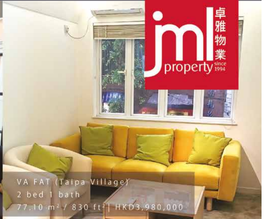
VA FAT (Taipa Village) 2 bed 1 bath 77.10 m 2 / 830 ft 2 | HKD3,980,000