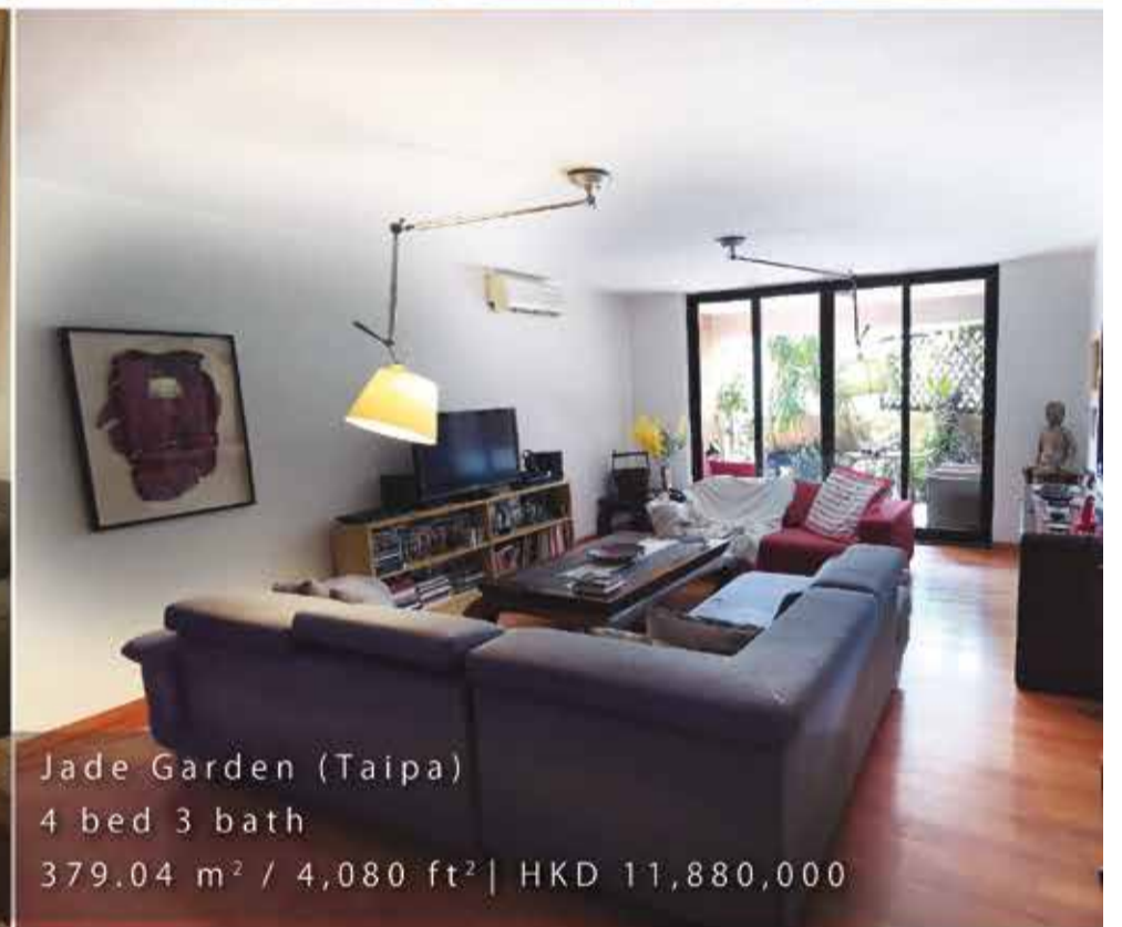
Jade Garden (Taipa) 4 bed 3 bath 379.04 m 2 / 4,080 ft 2 | HKD 11,880,000