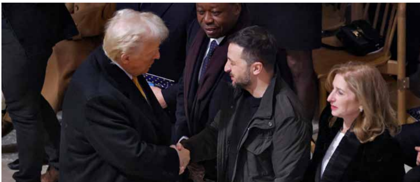
U.S. President-elect Donald Trump meets Ukraine's President Volodymyr Zelenskyy at Notre Dame Cathedral in Paris, last week