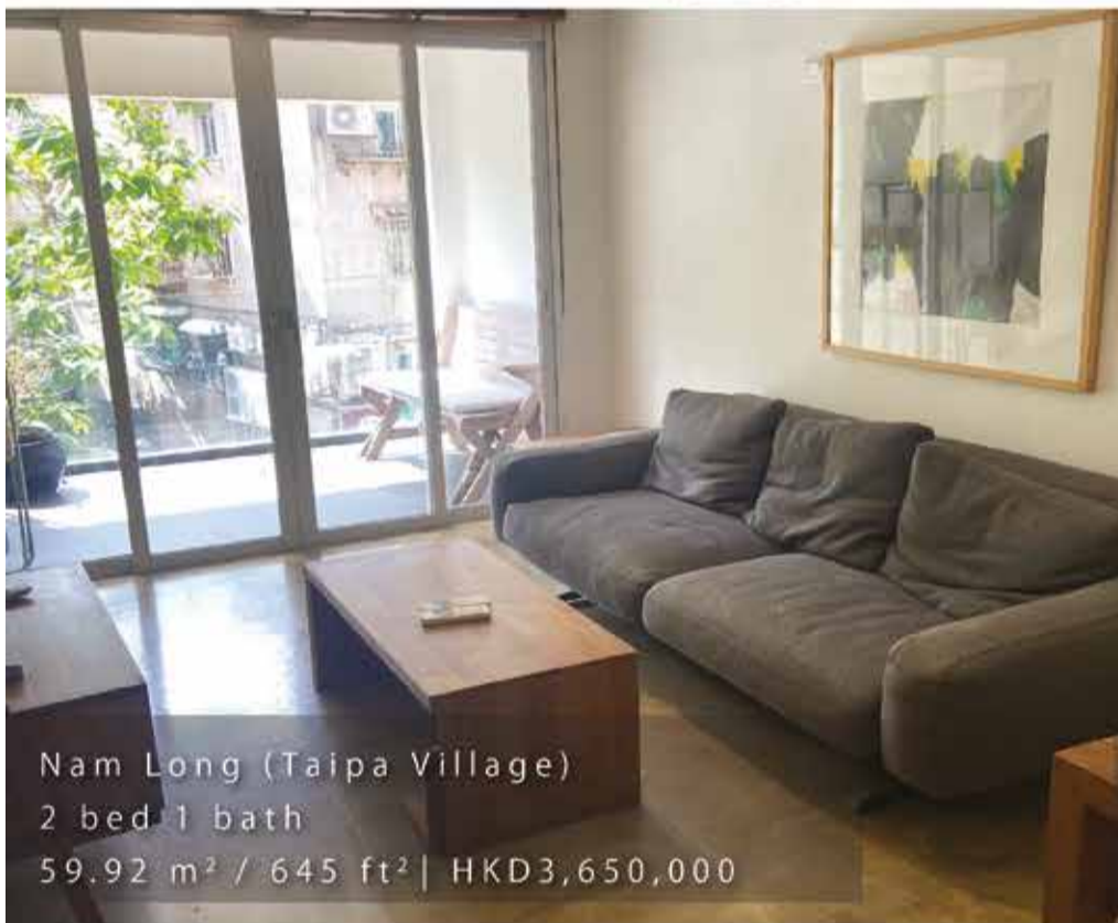
Nam Long (Taipa Village) 2 bed 1 bath 59.92 m 2 / 645 ft 2 | HKD3,650,000