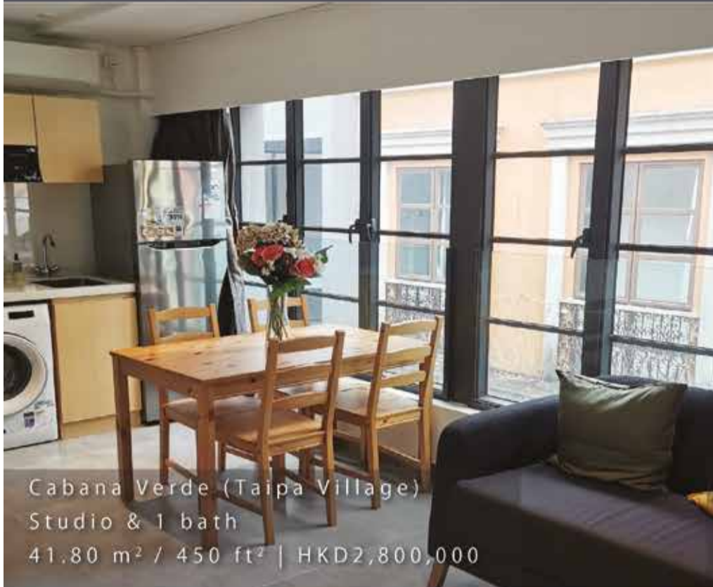
Cabana Verde (Taipa Village) Studio & 1 bath 41.80 m 2 / 450 ft 2 | HKD2,800,000