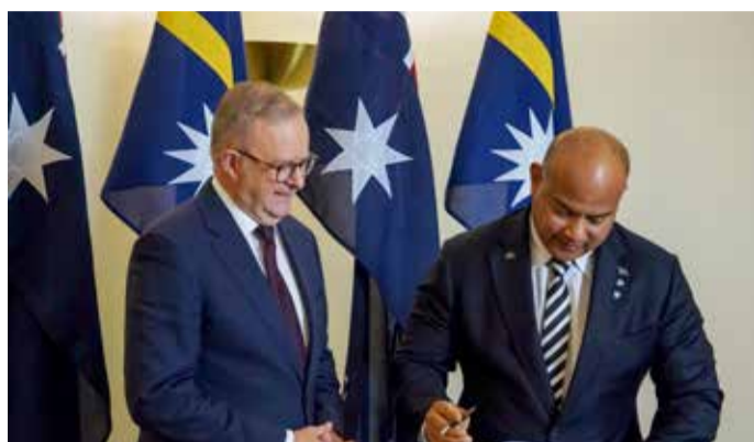
Australian Prime Minister Anthony Albanese looks on as Nauru President David Adeang (right) signs the Australian Parliament House guest book in Canberra

"Recognizing the security of one of us affects the security of both of us, the treaty provides that Nauru and Australia will jointly agree to any engagement by other countries in Nauru's security, banking and telecommunications sectors," Australian Prime Minister An-