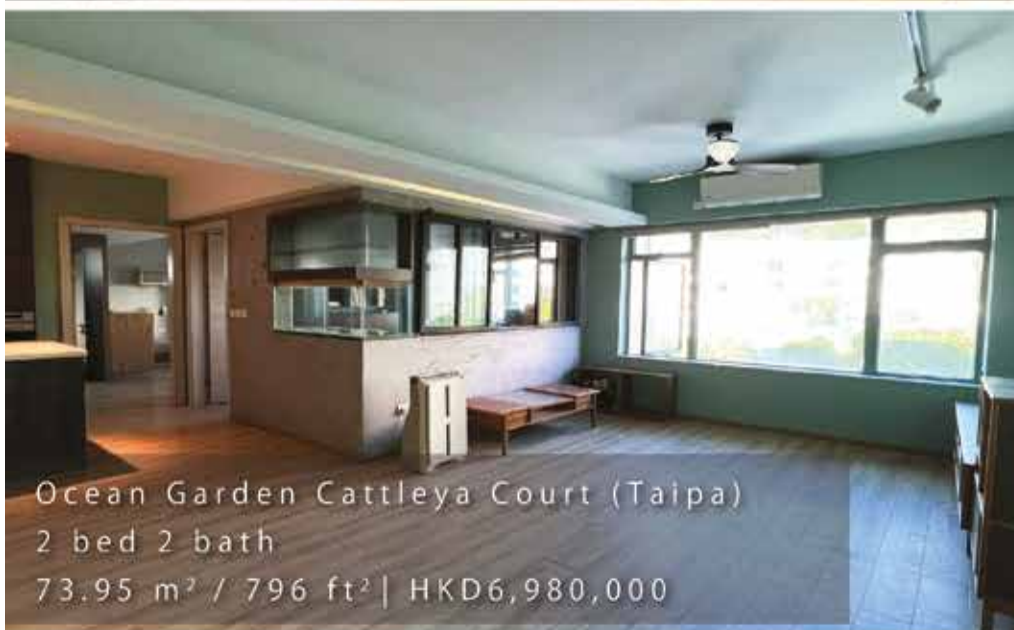
Ocean Garden Cattleya Court (Taipa) 2 bed 2 bath 73.95 m 2 / 796 ft 2 | HKD6,980,000