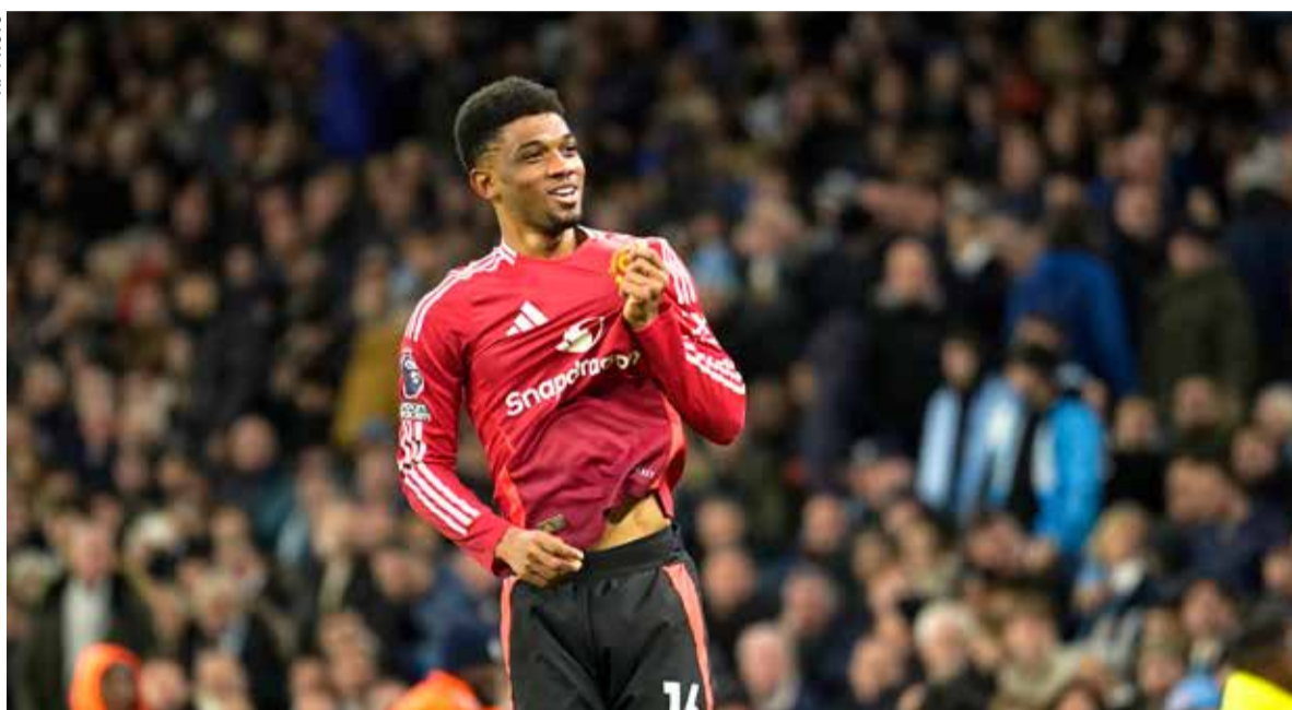
Manchester United's Amad Diallo celebrates after scoring his side's second goal

ded to one win and eight losses in 11 games.