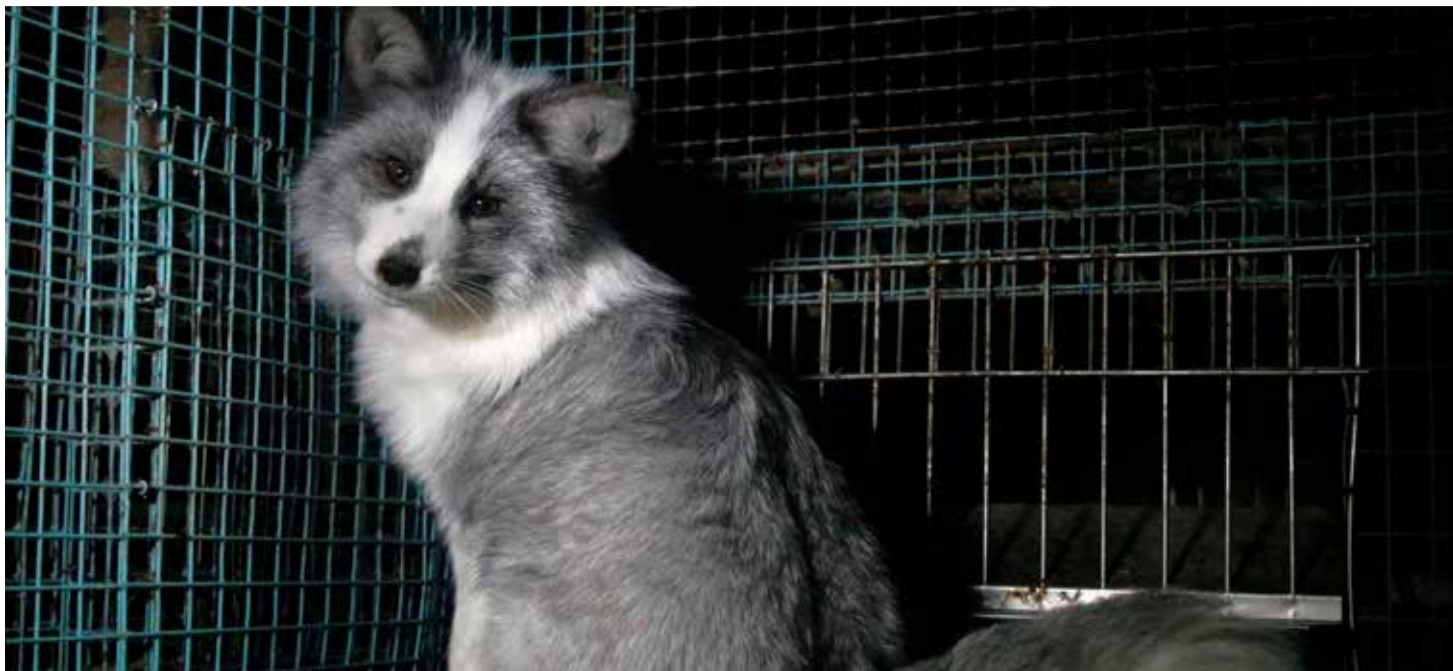
This photo provided by Humany Society International shows a fox inside a cage at a fur farm in western Finland