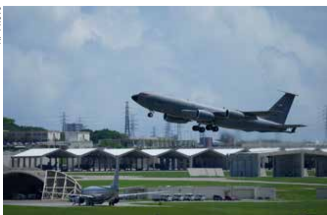
The Kadena Air Base airfield in Kadena Town, west of Okinawa

The relocation started with 100 members of III Marine Expeditionary Force stationed on Okinawa moving to the Pacific island for the initial logistical work, the U.S. Marine Corps and Japan's Defense Ministry said in a joint sta-