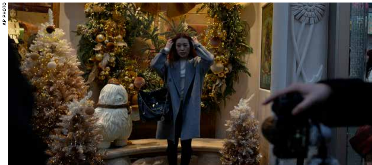
Christmas decorations at a popular mall in Beijing

Retail sales rose 3% from a year earlier, down from October's 4.8% increase and below the 3.5% an-