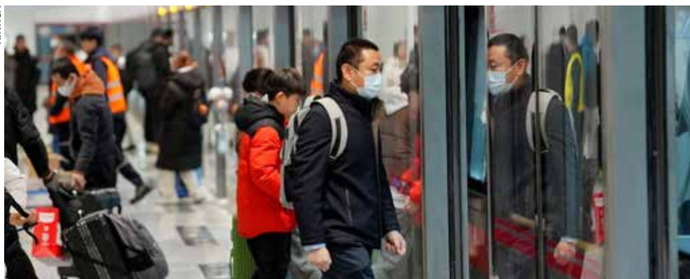
Passengers board a train of Subway Line 3 in Beijing

The three new lines are the first phase of Line 3, connecting Dongsishitiao