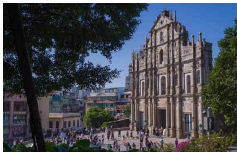
Tourists visit the Ruins of St. Paul's