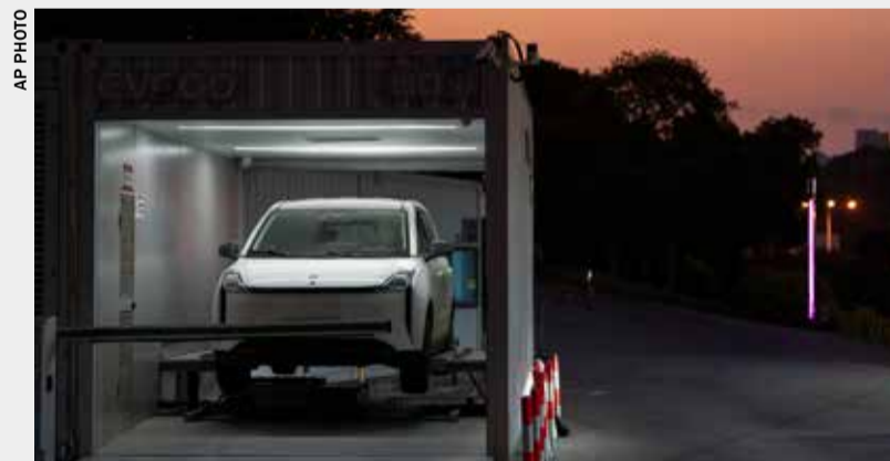
A driver gets his car battery swapped at a first generation station by China-based CATL battery manufacturing company, in Xiamen

Nothing on that scale exists elsewhere in the world, though