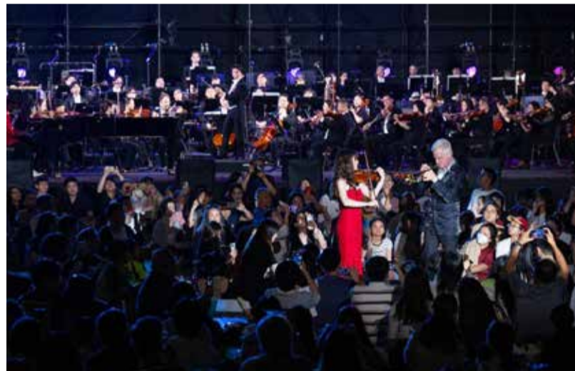
People enjoy an open-air concert at Macau Cultural Center Square