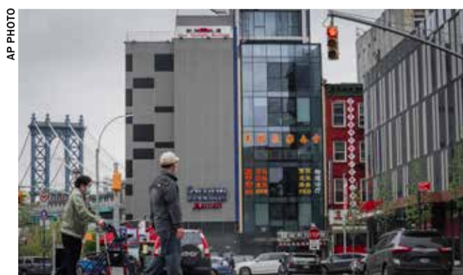
A six story glass facade building (center) alleged to be the site of a foreign police outpost for China in New York's Chinatown