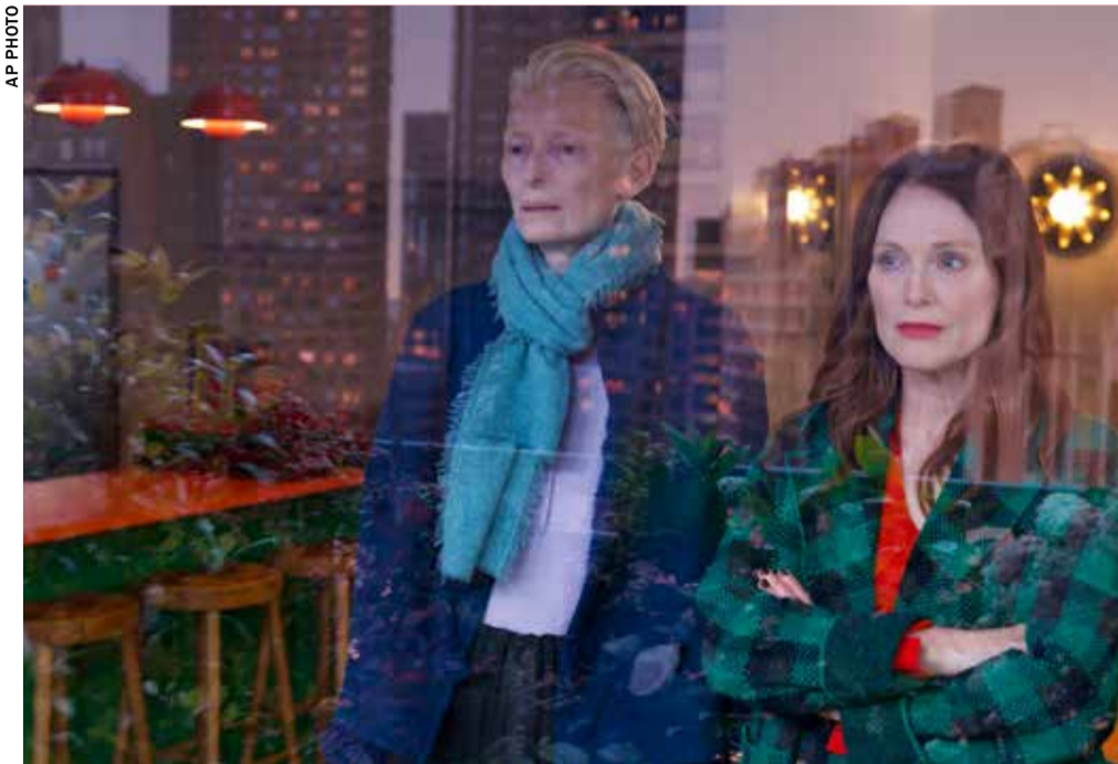
Julianne Moore (right) and Tilda Swinton in a scene from "The Room Next Door"

Music isn't a new phenomenon in airport terminals. Brian Eno's "Music for Airports," helped define the ambient music genre.