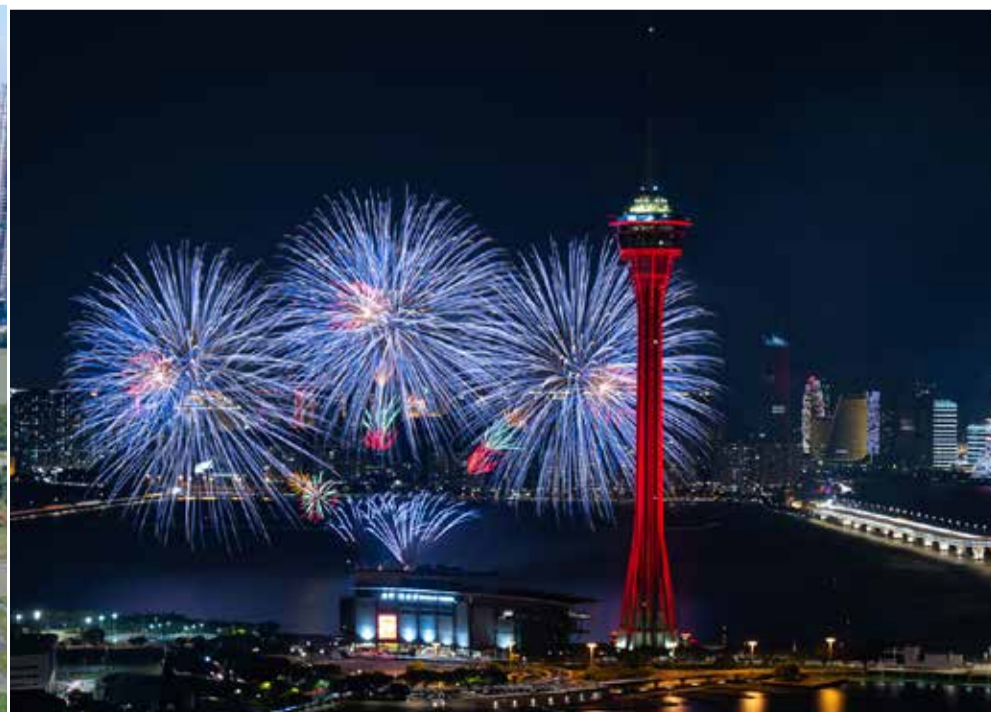
Fireworks illuminate the sky in Macau