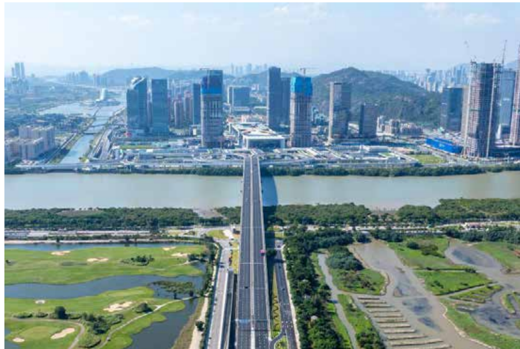
An aerial drone photo shows a view of the Lotus Bridge connecting south China's Macau and Hengqin