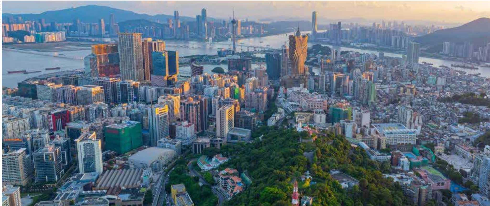
An aerial drone photo shows the Macau Peninsula (front)