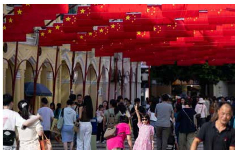
Tourists visit the Senado Square in Macau