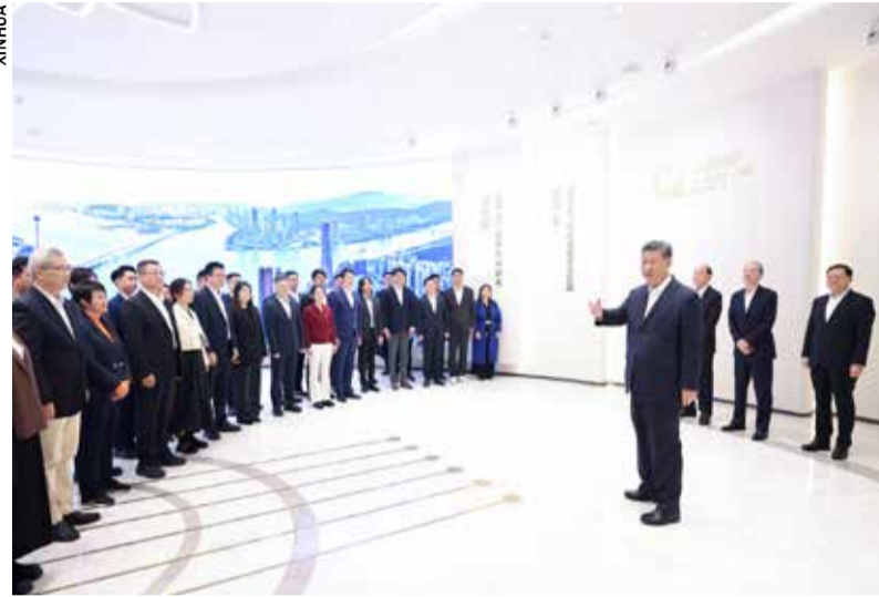
President Xi Jinping visits Guangdong-Macao Intensive Cooperation Zone in Hengqin

After MUST, the delegation traveled to the Cooperation Zone in Hengqin, where President Xi met with Macau residents who live and run businesses in the zone, as well as those involved in its planning, construction, management,