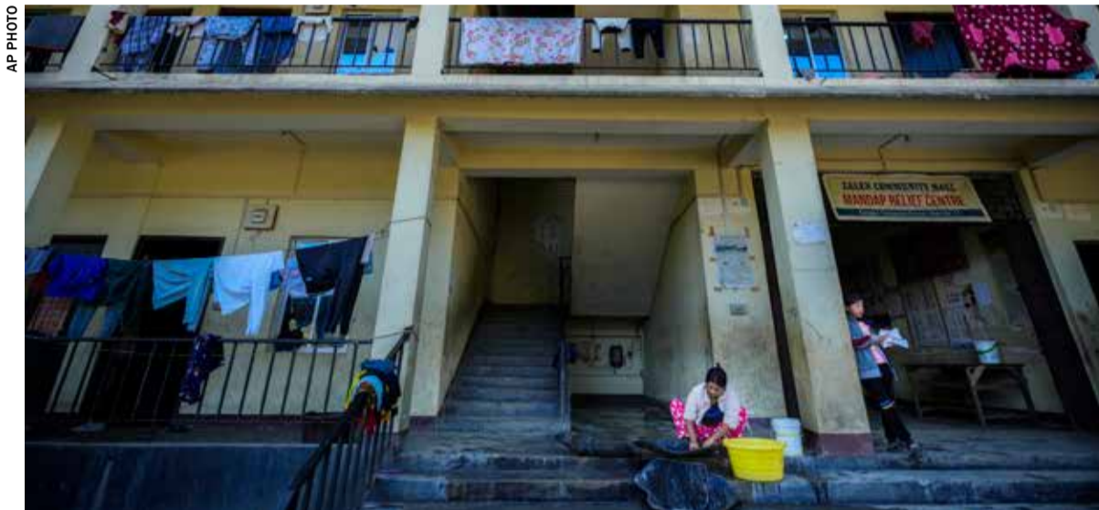
A Kuki tribal woman washes cloths outside a relief camp in Kangpokpi, Manipur, last week