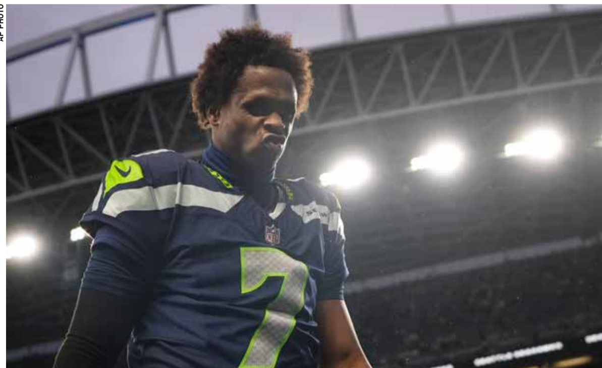
Seattle Seahawks quarterback Geno Smith (7) walks off the field after the 27-24 loss to the Minnesota Vikings of an NFL football game, Sunday

The Seahawks would still have a chance at the division title if Los