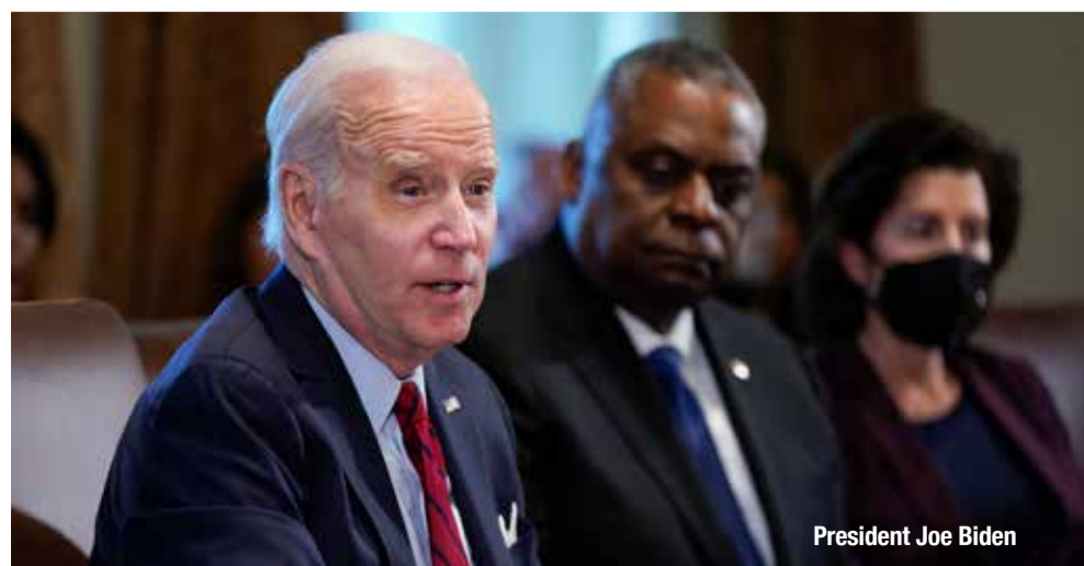
President Joe Biden

said Friday that $295 million in military sales had been approved.