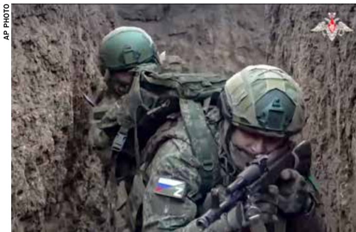
Russian servicemen attend a combat training for assault units in an undisclosed location, Jan. 4

U.S. Defense Secretary Lloyd J. Austin will attend the meeting. Biden was originally scheduled to attend the October summit in Ramstein but it was postponed because of response to Hurricane Milton that battered the U.S.