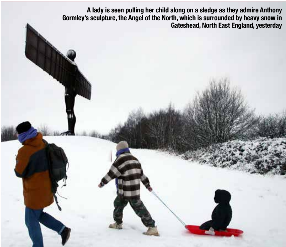
A lady is seen pulling her child along on a sledge as they admire Anthony Gormley's sculpture, the Angel of the North, which is surrounded by heavy snow in Gateshead, North East England, yesterday