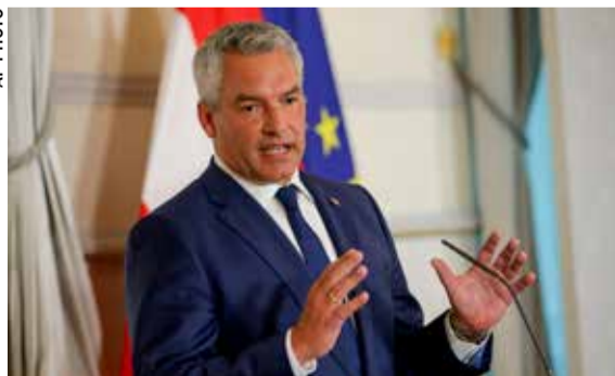
Austrian Chancellor Karl Nehammer

Social democratic leader Andreas Babler said he regretted the People's Party decision to end the talks. "This is