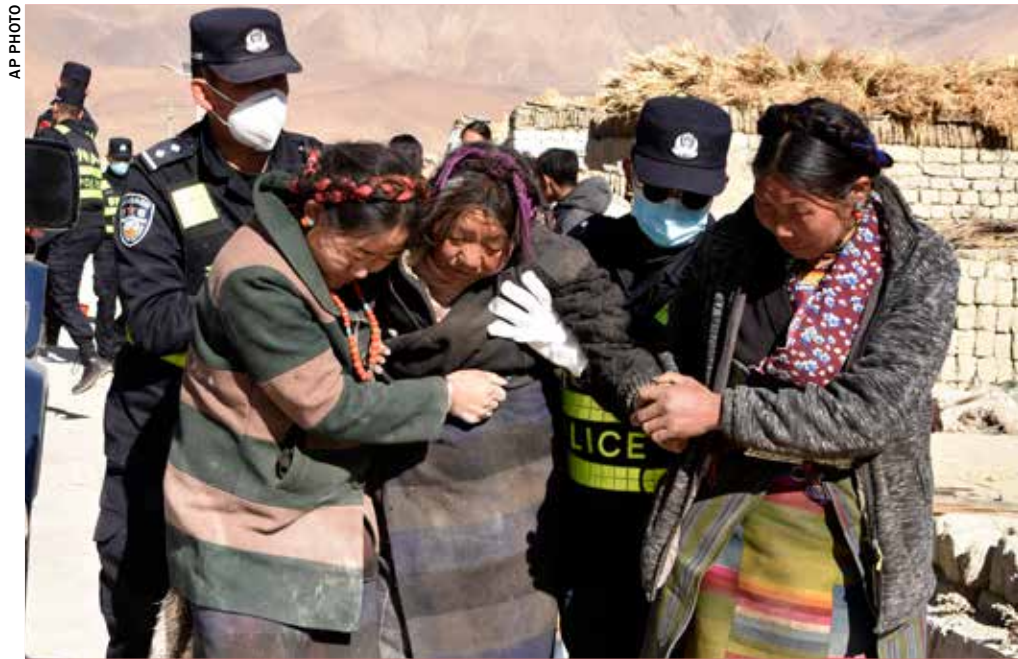
Rescuers transfer the injured at Zhacun Village of Dingri County in Xigaze, southwest China's Tibet Autonomous Region, Tuesday

The area is known as a haven for criminal syndicates who have forced hundreds of thousands of people in Southeast Asia into participating in online scams including false romantic ploys, bogus investment pitches and illegal gambling schemes.