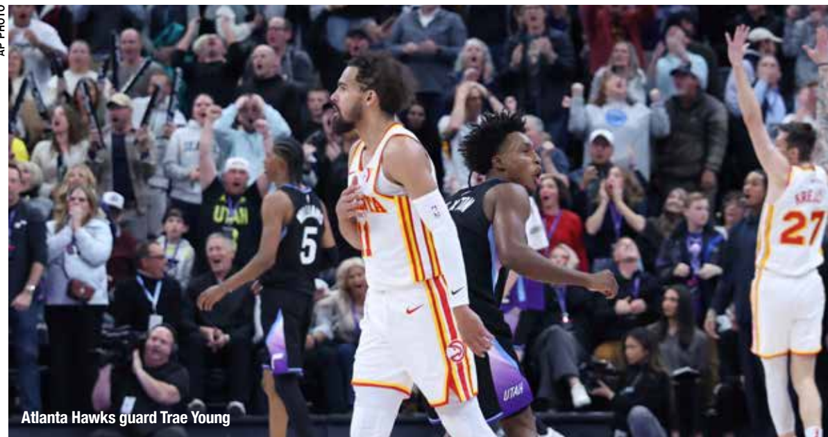
Atlanta Hawks guard Trae Young

Young, the Hawks' franchise leader in assists and made 3-pointers, put on a clinic on how to control a game. He dished out