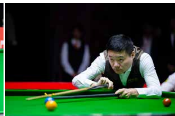
Ding Jun Hui