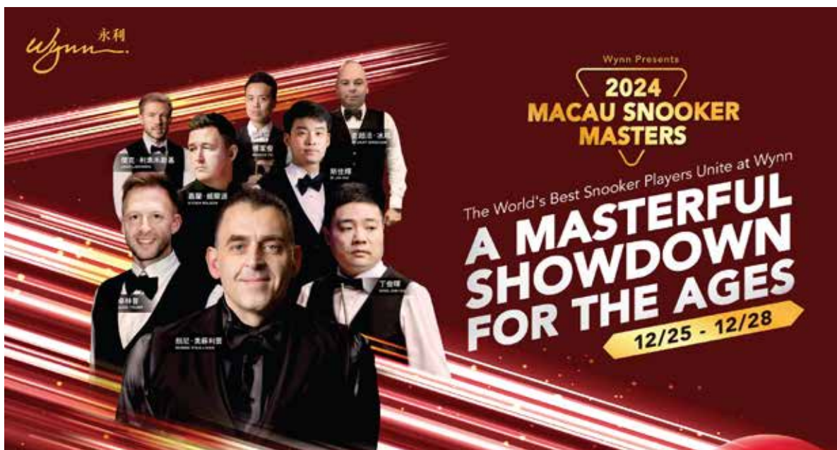
Wynn Presents - 2024 Macau Snooker Masters

Not only is sport a great form of exercise and entertainment, but it also forms a bridge that crosses cultural boundaries and unites people from across the world in celebration of unique strengths, skills, and talents and appreciation of the dedication, perseverance, and indefatigable spirit that all sport professionals embody. The power and influence of sports tourism has now become so important in Macao and is fundamental to the Macao SAR Government's "1+4" moderate diversification develop-