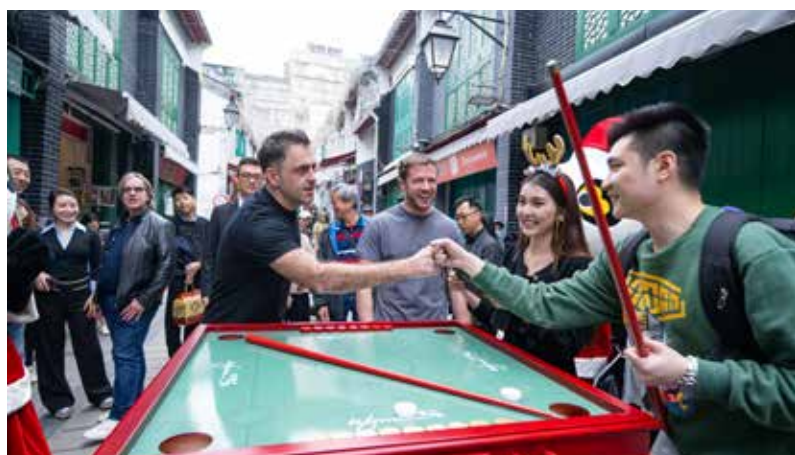
O'Sullivan and Lisowski enjoyed recreational checkers with snooker enthusiast

In 2025, Wynn hopes to attract even more high-profile, global sports events to Macao, encouraging even more international sports enthusiasts to visit the city and also enjoy many of the other experiences Macao has to offer, and thereby boost Macao's global image as a World Center of Tourism and Leisure.