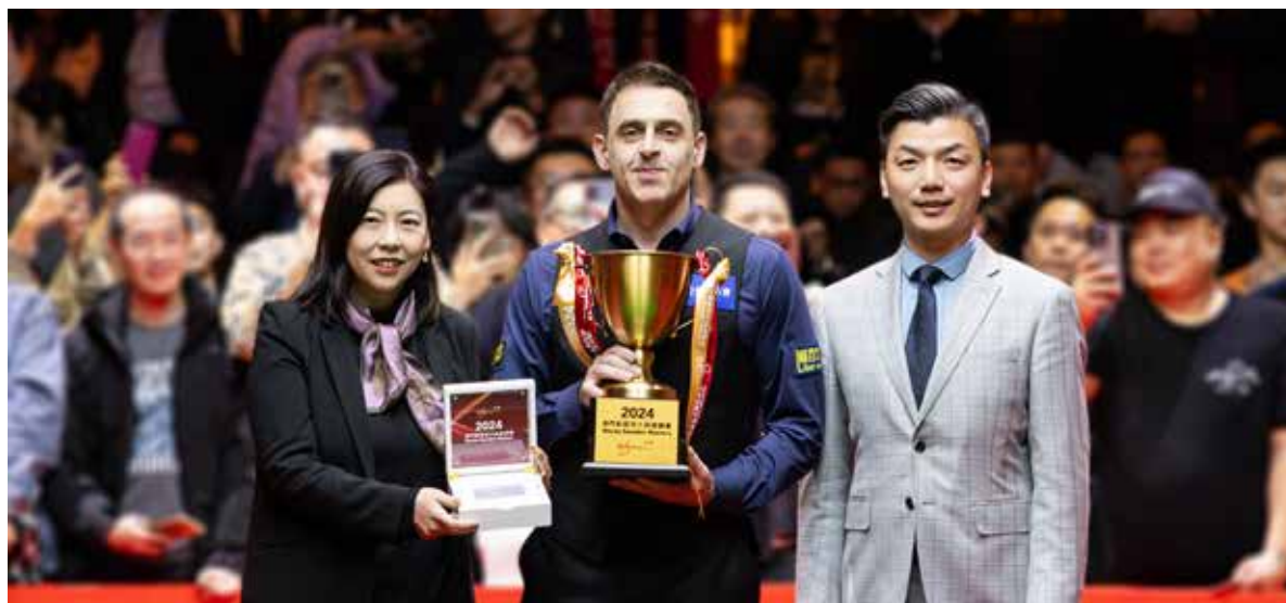
"Wynn Brand Ambassador" Ronnie O'Sullivan won five out of seven matches

ment strategy for which Wynn continues to bring high-quality events to Macao in an effort to expand international markets.