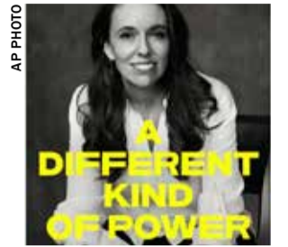
New Zealand Former Prime Minister Jacinda Ardern will release her memoir, "A Different Kind of Power," in June. Its publisher announced yesterday The book explores her leadership journey, responses to crises, and decision to step down after six years in office.