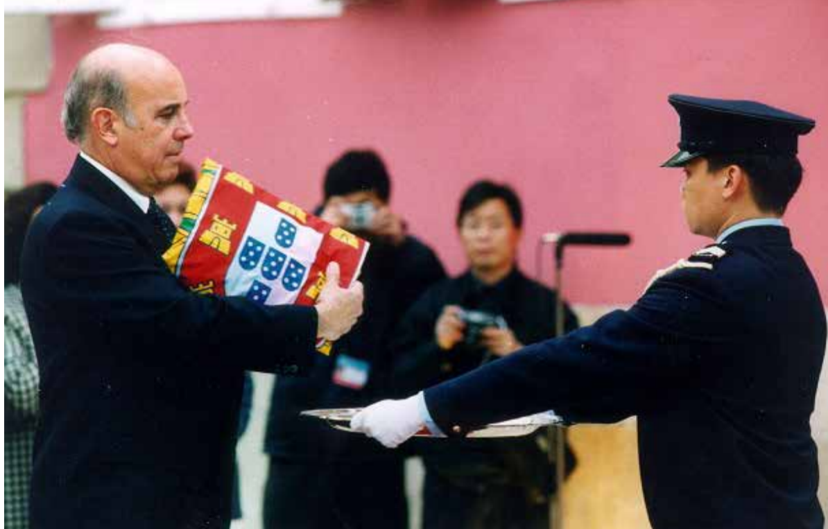
Vasco Rocha Vieira during the 1999 handover