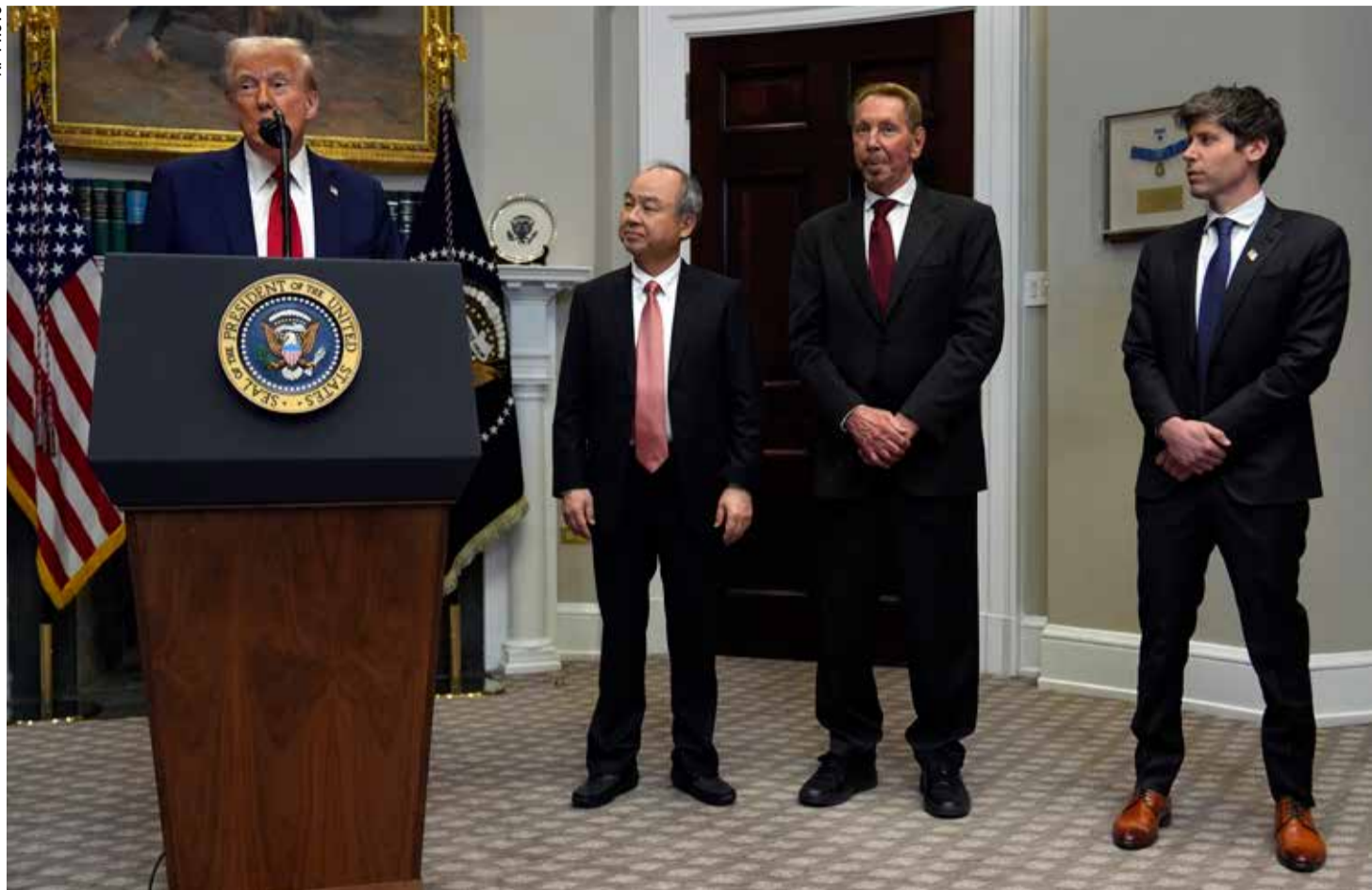
President Donald Trump speaks in the Roosevelt Room at the White House, as Softbank CEO Masayoshi Son, Oracle chief technology officer Larry Ellison and OpenAI CEO Sam Altman, listen