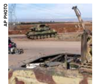
Syria New interim rulers face challenges unifying former rebel factions into a national army after a surprise offensive ousted Assad. Southern rebel groups remain cautious, reflecting differing ideologies and unresolved tensions, complicating efforts to stabilize the fractured nation.

Malaysian Prime Minister Anwar Ibrahim takes the podium after the southeast Asian nation and its neighbor Singapore struck a deal to create a special economic zone that would ramp up job creation and lure investment.