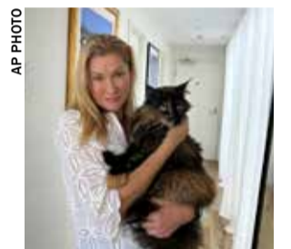
New Zealand Mitten the cat accidentally traveled between New Zealand and Australia three times after being overlooked in a plane cargo hold. The pet was safely reunited with its owner in Melbourne, yesterday Air New Zealand apologized for the oversight.