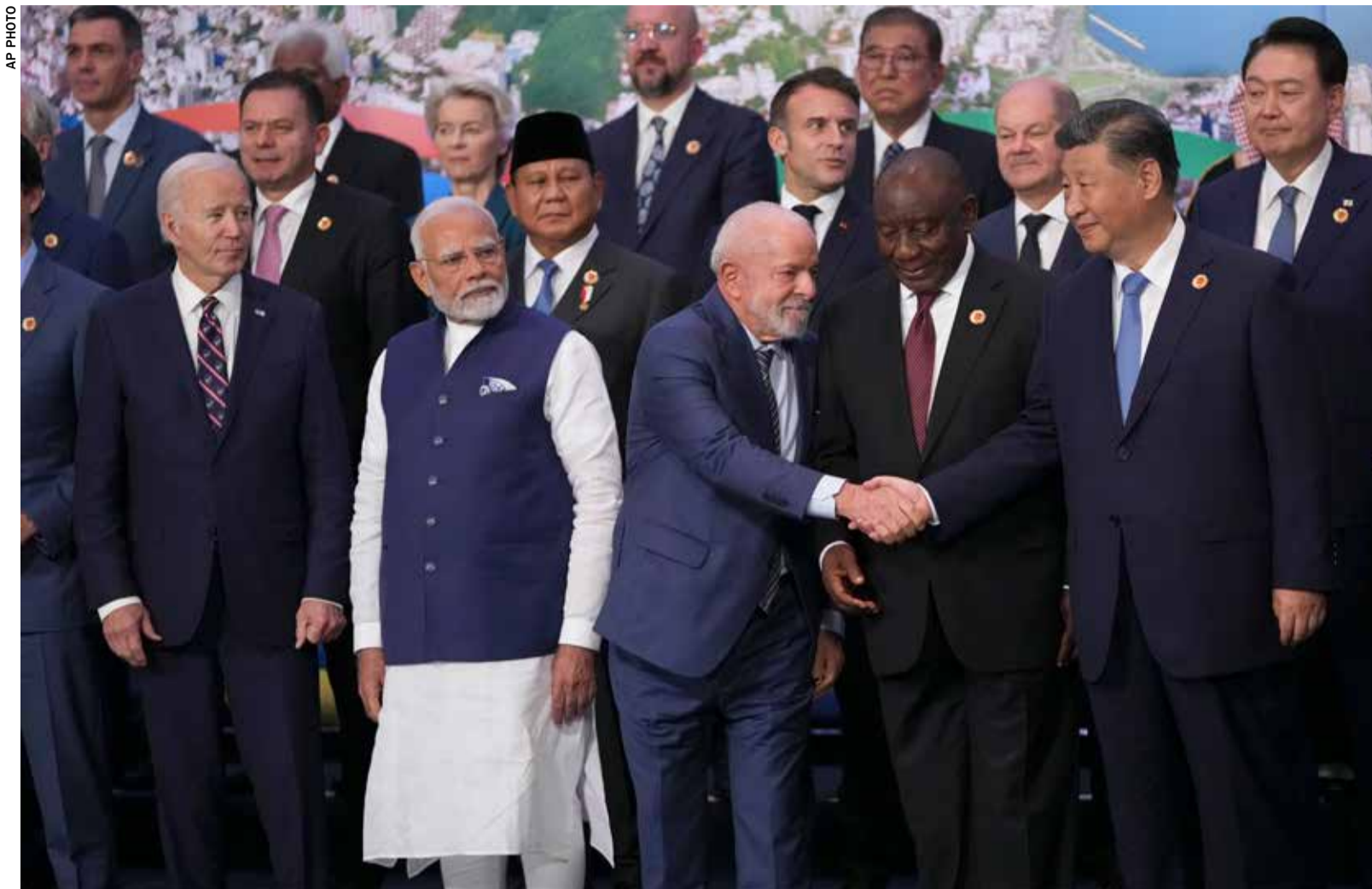
From left, Biden, Modi, Lula da Silva, Ramaphosa and President Xi Jinping gather for a G20 Summit world leaders' group photo, in Rio de Janeiro, last November