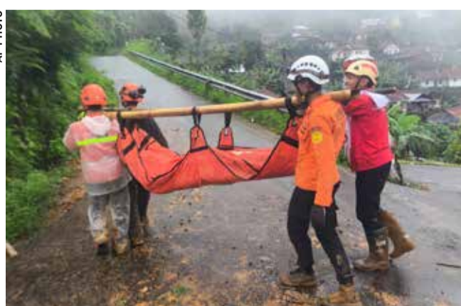
In this undated photo released by Indonesia's National Disaster Management Agency yesterday, rescuers carry the body of a victim of flash flood which triggered a landslide, in Pekalongan, Central Java