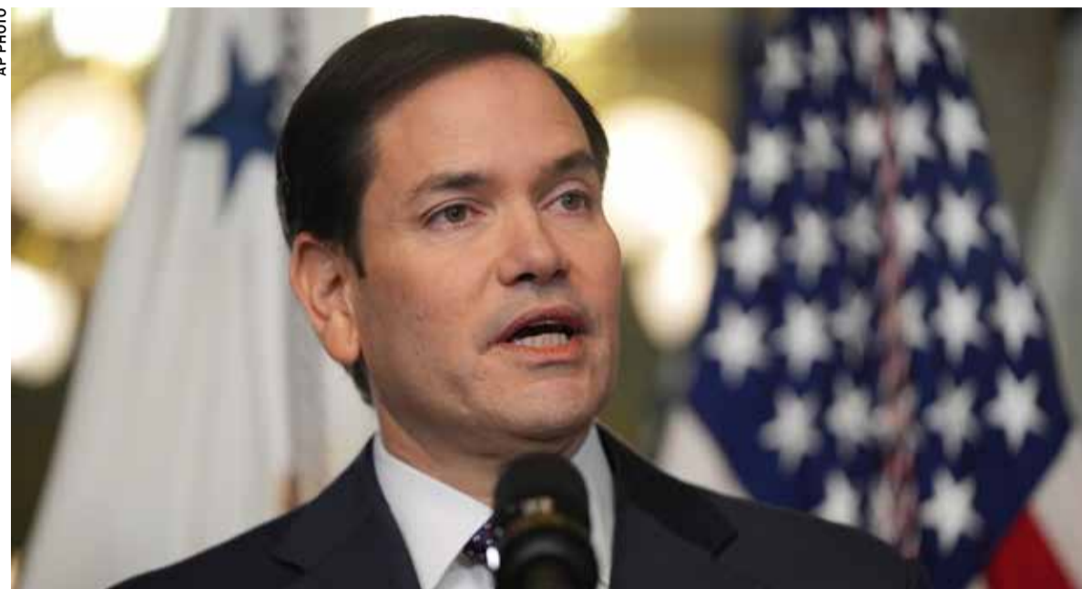
Secretary of State Marco Rubio speaks after being sworn in by Vice President JD Vance in the Vice Presidential Ceremonial Office in the Eisenhower Executive Office Building on the White House campus

"Our four nations maintain our conviction that international law, economic opportunity, peace, stability, and security in all domains including the maritime domain underpin the development and prosperity of the peoples of the In-