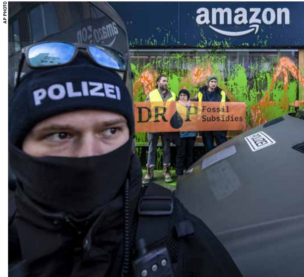
Activists of Drop Fossil Subsidies protest after they sprayed an Amazon shop window with paint as a police officer cordons off the area, in Davos