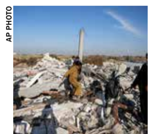
Gaza A ceasefire has revealed immense destruction after 15 months of Israel-Hamas conflict. Entire neighborhoods lie in ruins, displacing 90% of Gaza's population. International critics allege war crimes, while Israel denies claims, citing military necessity in urban warfare.