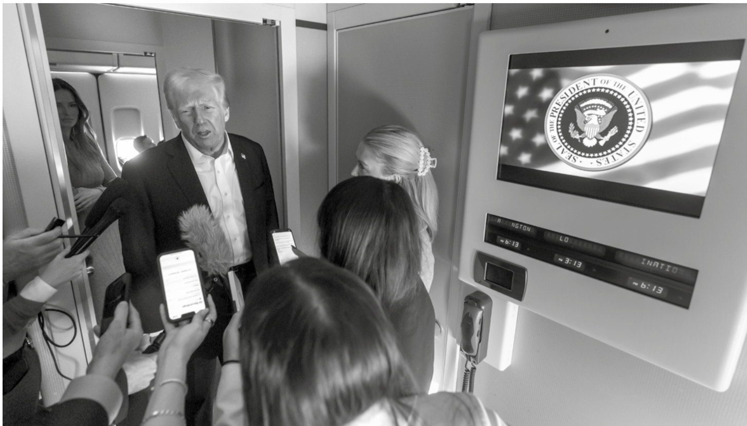
President Donald Trump speaks to reporters aboard Air Force One as he travels from Las Vegas to Miami on Saturday