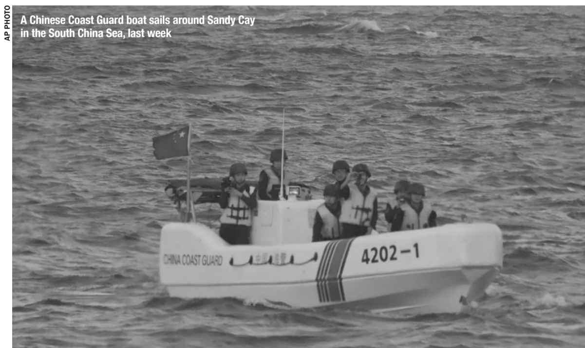
A Chinese Coast Guard boat sails around Sandy Cay in the South China Sea, last week

ppine coast guard show a Chinese coast guard ship sailing very close to a vessel officials identified as belonging to the Philippines. Another video shows a Chinese military helicopter hovering low over the rough seas near a vessel flying a Philippine flag.