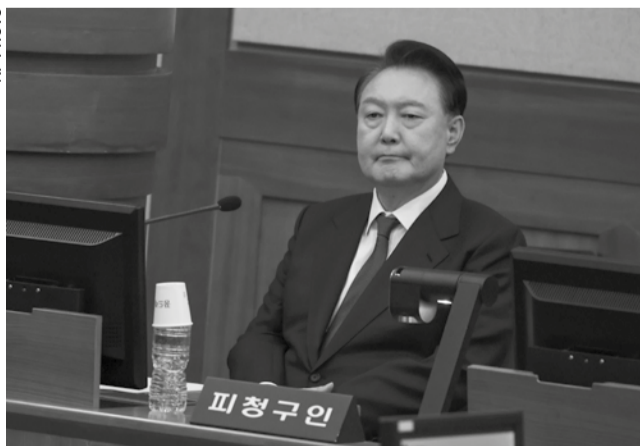
South Korea's impeached President Yoon Suk Yeol

Yoon, a conservative, has steadfastly denied any wrongdoing, calling his martial law a legitimate act of governance meant to raise public