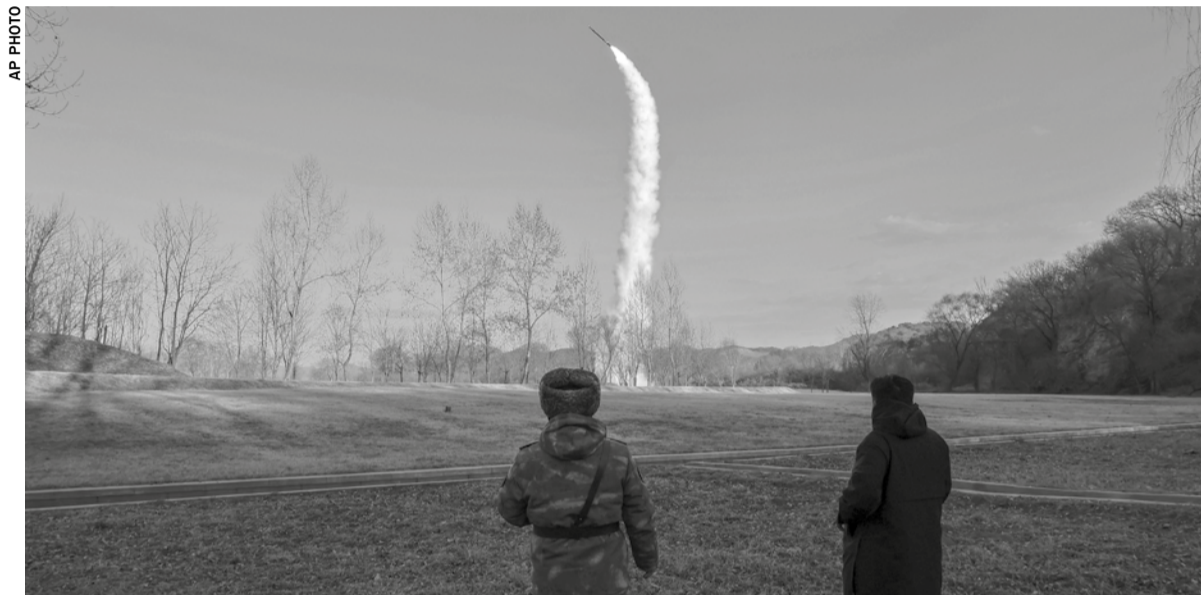
Leader Kim Jong Un, right, inspects testing of sea-to-surface strategic cruise guided weapons at an undisclosed location in North Korea, Saturday

KCNA cited Kim as saying that North Korea's war deterrence capabilities "are being perfected more thoroughly" and affirming that his country will make "strenuous efforts" to defend stability "on the basis