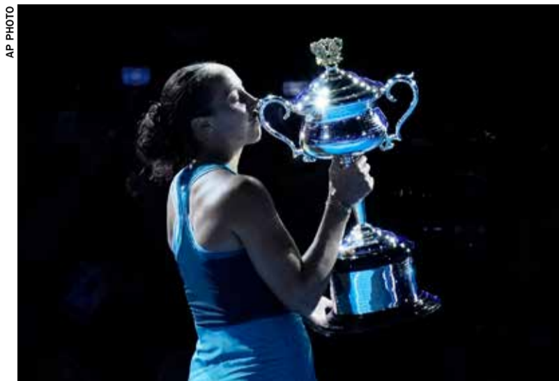
Madison Keys of the U.S. kisses the Daphne Akhurst Memorial Cup at the Australian Open tennis championship in Melbourne, Australia, Saturday

"I just kept saying, 'Be brave.' And, 'Go for it.' I kind of just kept repeating that. That