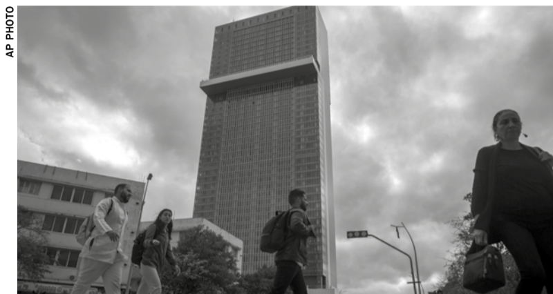
People walk past the Selection La Habana new hotel, managed by Spanish chain Iberostar, in Havana, Cuba