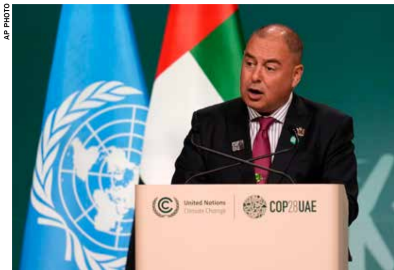
Cook Islands Prime Minister Mark Brown