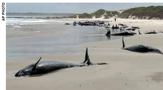
False killer whales which became stranded on a remote beach near Arthur River in the island state of Tasmania

Unfavorable ocean and weather conditions, which prevented the whales from