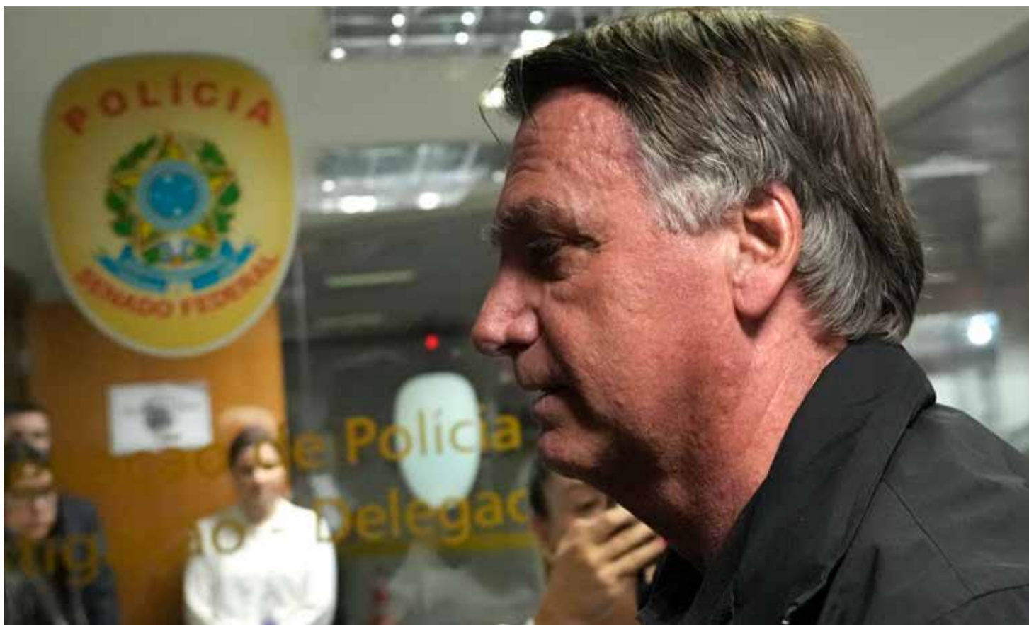
Former Brazilian President Jair Bolsonaro arrives for a luncheon with senators from his support base at the National Congress building in Brasilia