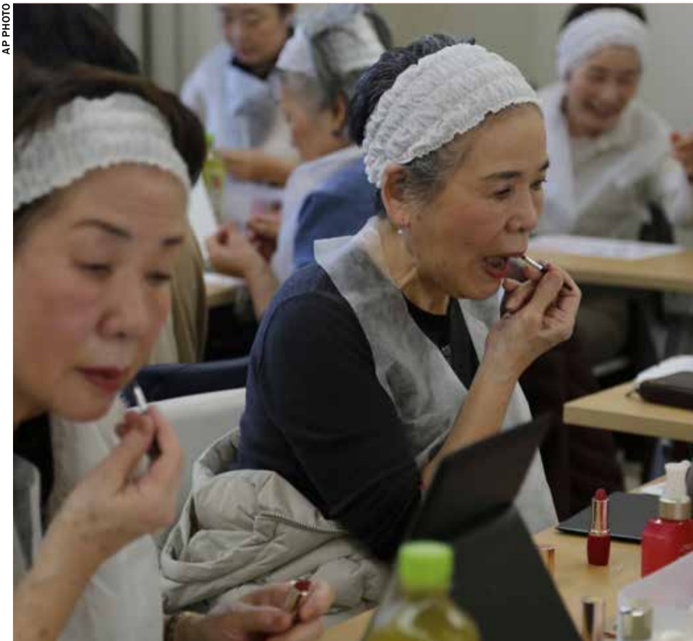
Women try on the lipstick of the color they like as they take part in a special makeup class at a community center room in Tokyo

A urban village of more than 100,000 residents living in crowded neighborhoods and residential condominium towers, Addition Hills has done clean-ups, canal de-clogging and a hygiene campaign to combat dengue. But when cases spiked to 42 this year and two young students died, village leader Carlito Cernal decided to intensify the battle.