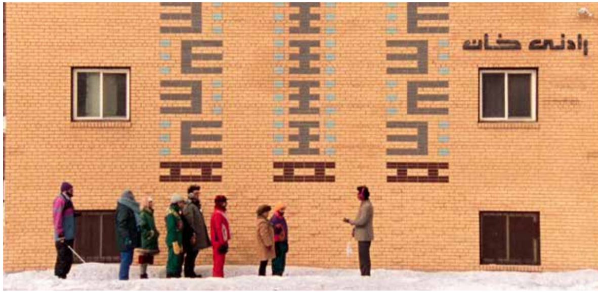
A scene from the film "Universal Language"

The gags start immediately, with an opening title logo for "A Presentation of the Winnipeg Institute for the Intellectual Development of Children and Young People" — a twist on the Iranian institute that produced '70s classics, like Kiarostami's Koker trilogy.