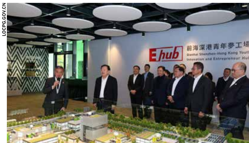
Xia Baolong visited the Qianhai Shenzhen-Hong Kong Youth Innovation and Entrepreneur Hub last week

Some positive developments will be agreed under the GBA, including the data-transfer agree-