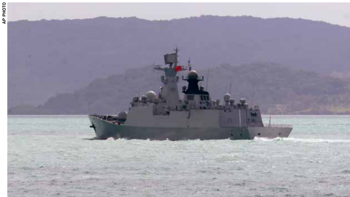
In this photo provided by the Australian Defense Force, the People's Liberation Army-Navy Jiangkai-class frigate Hengyang travels in the Torres Strait off Australia's coast

Marles said Australian navy ships and air force planes were monitoring the Chinese ships' movements through international waters that are in Australia's exclusive economic zone, the area beyond its territorial waters where a nation has exclusive eco-