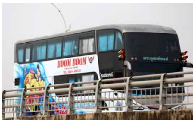
A bus, believed to be carrying Chinese nationals, crosses the 2nd Thai-Myanmar Friendship Bridge in Mae Sot in Thailand's Tak province

Thailand, China and Myanmar have coordinated efforts over the past month to shut down the scam centers that bilked victims around the world out of billions of dollars through false romantic ploys, bogus investment pitches and ille-