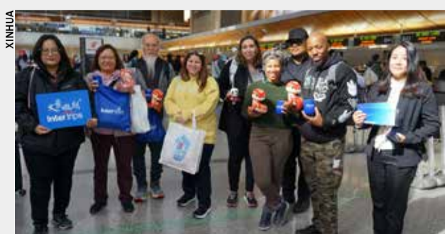
US tourists of a first-ever themed trip to GBA pose at the Los Angeles Airport this week

Following the first GBA tour from Los Angeles, more travel routes to China will be organized in collaboration with American travel agencies, according to Air China North America. XINHUA