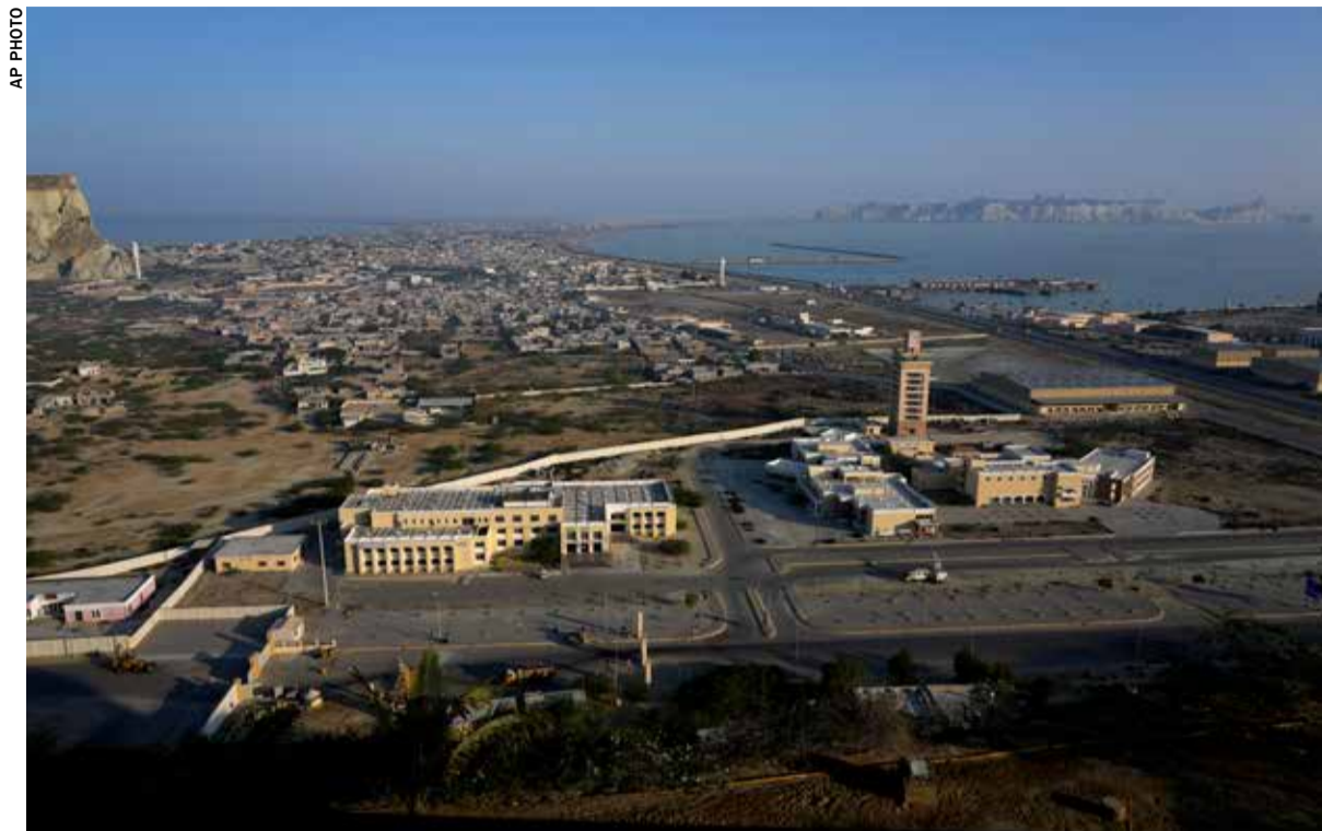
A view of newly developing area, bottom, and downtown area seen from a hilltop in the coastal city of Gwadar