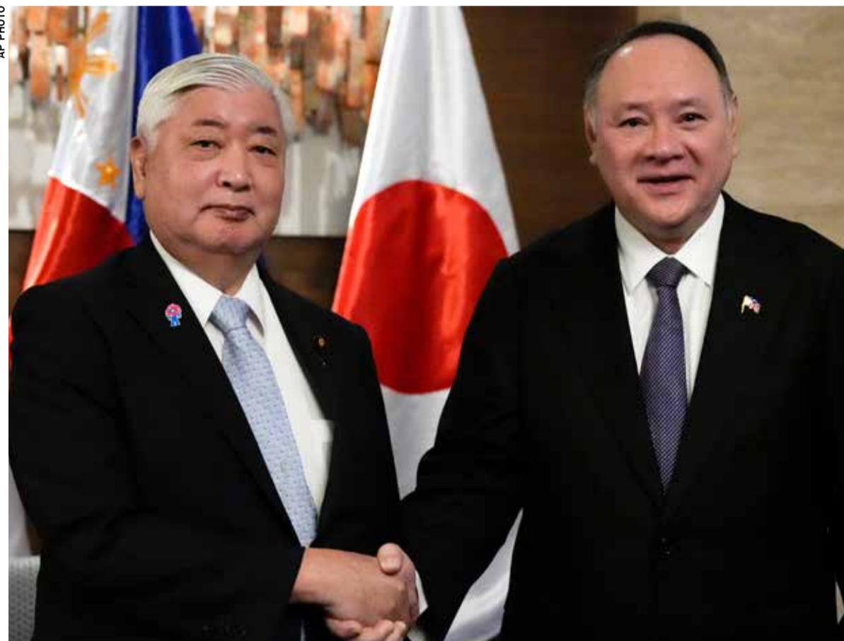
Philippine Defense Secretary Gilberto Teodoro (right) greets his Japanese counterpart Gen Nakatani in Makati city, yesterday

Japan and the Philippines, however, have steadily deepened defense and security ties largely due to concerns over Chinese assertiveness in the region. MDT/AP