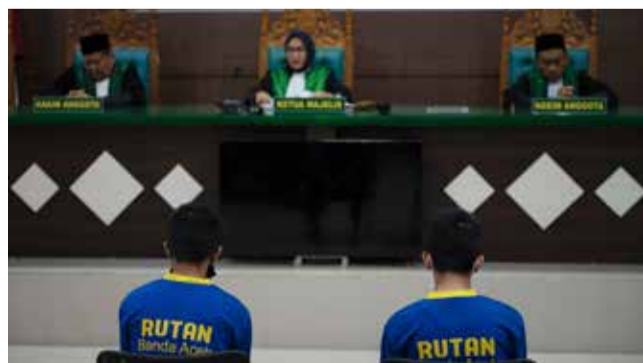
Two gay men sit inside a courtroom during their trial at Sharia court in Banda Aceh, yesterday

The lead judge said that the two college students were "legally and convinc-