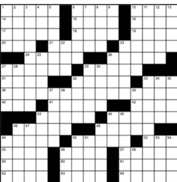
Crossword puzzles provided by BestCrosswords.com