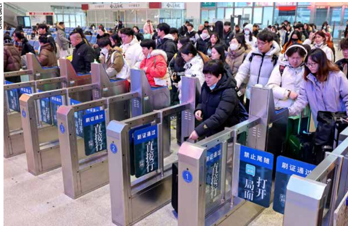
Passengers go through ticket checks at the Zaozhuang Railway Station in Shandong province on Saturday, the last day of this year's Spring Festival travel rush

"As Chinese people are getting richer, they are not only enjoying the Spring Festival holiday by returning home but are also finding more di-