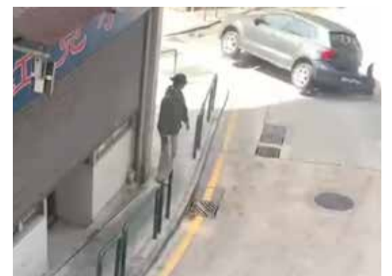
A screenshot showing the car starting to lose control towards Largo do Aquino

Local media reports indicate that the car, which was part of the filming crew, lost control after turning from Rua do Seminário towards Largo do Aquino. The injured included three men and nine women, ranging in age from 5 to 61.