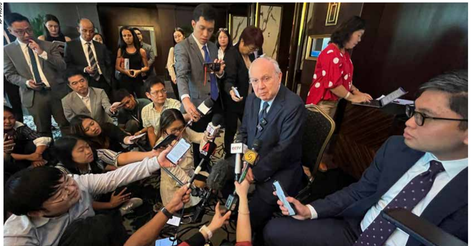
Philippine Ambassador to the U.S. Jose Romualdez (center) during a news conference with the Foreign Correspondents Association in Manila, yesterday

That has aligned with Marcos' thrust to strengthen his country's external defenses to protect the territorial interests of the Philippines in the South China Sea. MDT/AP