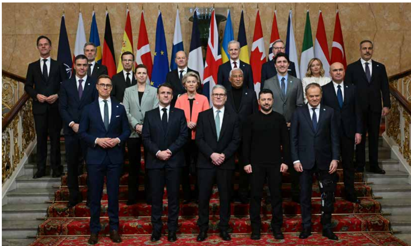
Britain's Prime Minister Keir Starmer, front center, hosts the European leaders' summit to discuss Ukraine, at Lancaster House, London

Starmer pledged to supply more arms to defend Ukraine, announcing that the U.K. will use 1.6 billion pounds ($2 billion) in export financing to supply 5,000 air defense missiles.