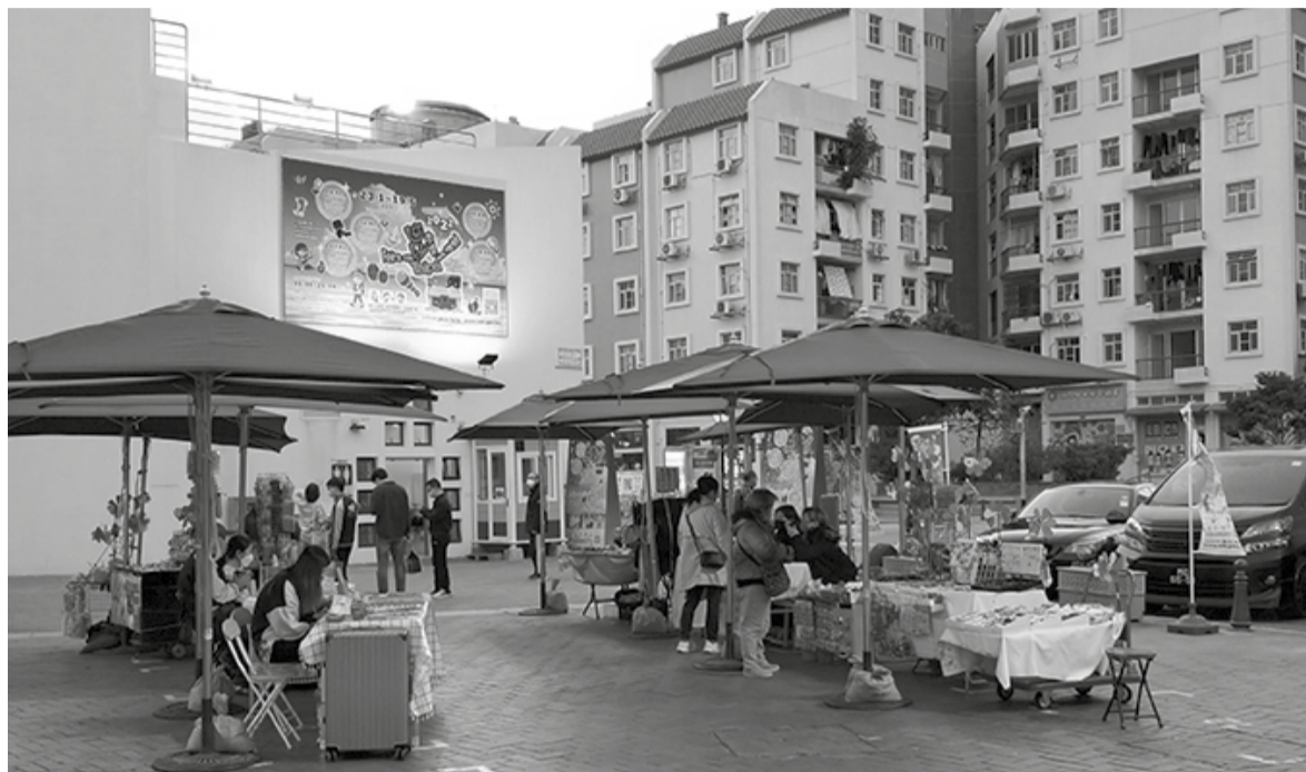
Stalls next to Taipa wet market

Despite these changes, some locals still value the market for its fresh goods and unique offerings. "I think the goods here are fresher. It's also an extra place for me to shop. I don't really like packaged products in supermarkets. That's why I come to the market to buy