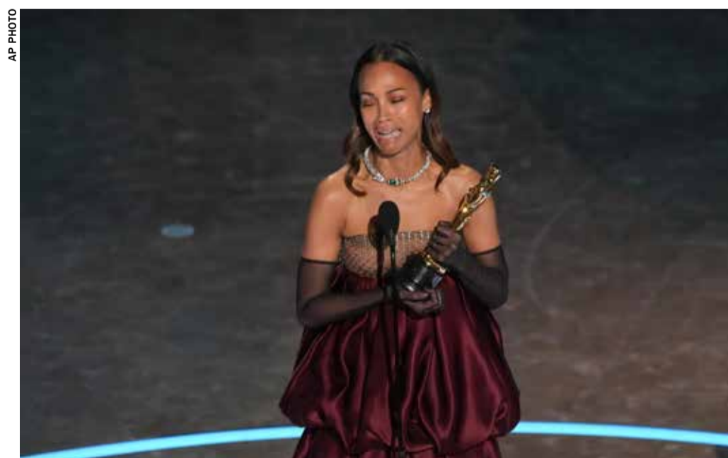
Zoe Saldña, first Dominican to win an award

Grande, in a red sparkly dress, performed a rendition of "Somewhere Over the Rainbow" from "The Wizard of Oz." Then Erivo, in a white gown with floral embellishments, took the stage to sing a staggering rendition of "Home" from "The Wiz." They joined up for "Wicked's" "Defying Gravity,"