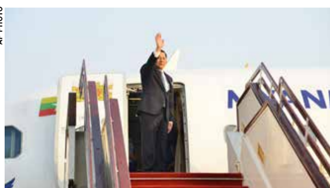
Myanmar's military leader Senior Gen. Min Aung Hlaing waves as he departs from Naypyidaw international airport, Myanmar

The report said Min Aung Hlaing will also meet with other top Russian officials and discuss bilateral ties, economic affairs and security with the aim to strengthen