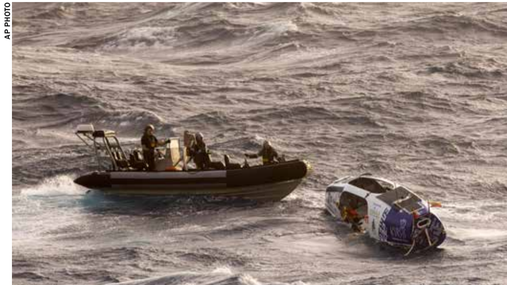
Australian Navy sailors from HMAS Choules use an inflatable boat to rescue Lithuanian rower Aurimas Mockus, yesterday

A seat reserved for a U.S. representative sat empty yesterday, the start of the Week 2 of the council’s 5-1/2 week session. The rights body holds three sessions a year.