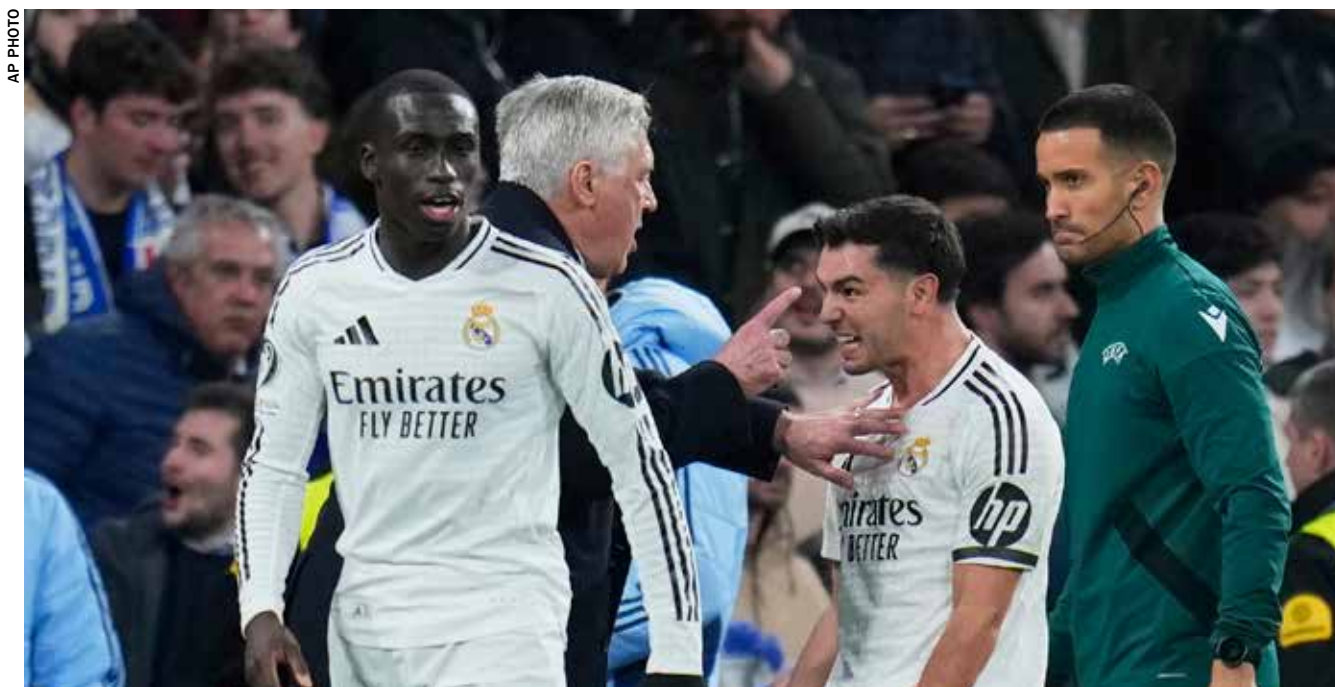
Real Madrid's Brahim Diaz (right) celebrates with his head coach Carlo Ancelotti after scoring his side's second goal

"It stemmed from a nice ball from Fede Valverde,"