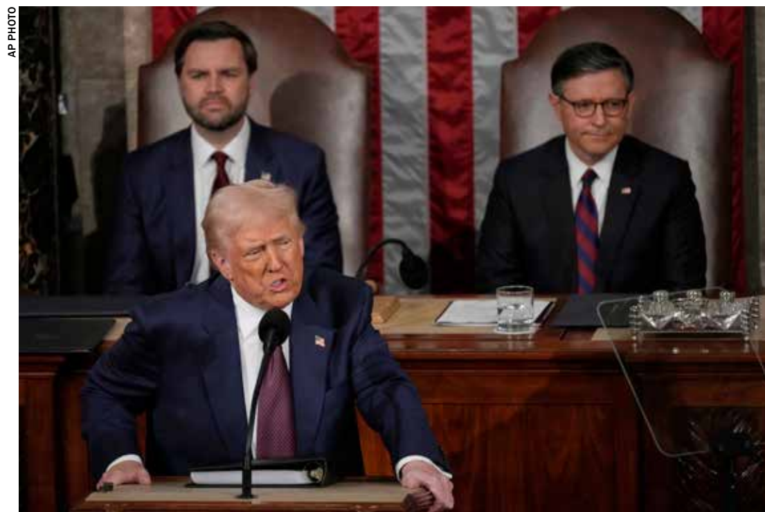
President Donald Trump addresses a joint session of Congress in the House chamber at the U.S. Capitol in Washington

Emboldened after overcoming impeachments in his first term, outlasting criminal prosecutions in between his two administrations and getting a tight grip on the GOP-led Congress, Trump has embarked on a mission to dismantle parts of the federal government, remake the relationship with America's allies and slap on tariffs that have sparked a North