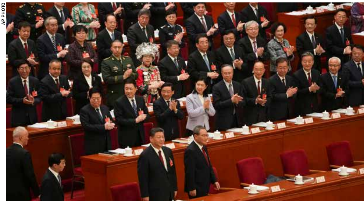
President Xi Jinping and Chinese Premier Li Qiang arrive for the opening session of the NPC at the Great Hall of the People in Beijing, yesterday

The annual report placed more emphasis on reviving domestic demand and consumption than last year's version, echoing a shift by the ruling Communist Party at meetings in December. It said the government should "make domestic demand the main engine and