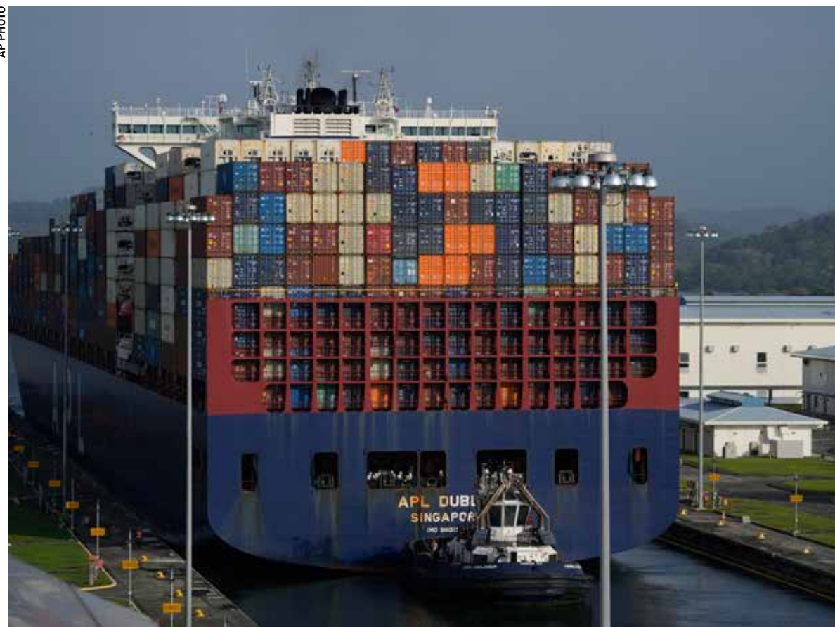
A cargo ship goes through the Panama Canal's Cocoli locks in Panama City

Some 70% of the sea traffic that crosses the Panama Canal leaves or goes to U.S. ports. The United States built the