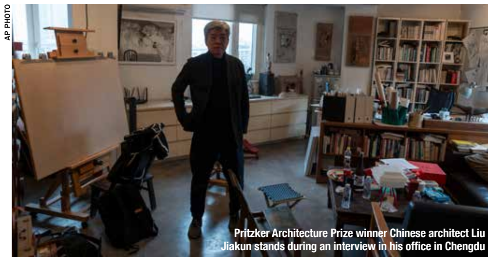
Pritzker Architecture Prize winner Chinese architect Liu Jiakun stands during an interview in his office in Chengdu

"To simplify, the task of architects is to provide a better living environment for human beings," he said, speaking in Mandarin. "First of all, you do something that is functional. But if it is just like that, it cannot be called architecture. (So) you have to provide poetry."