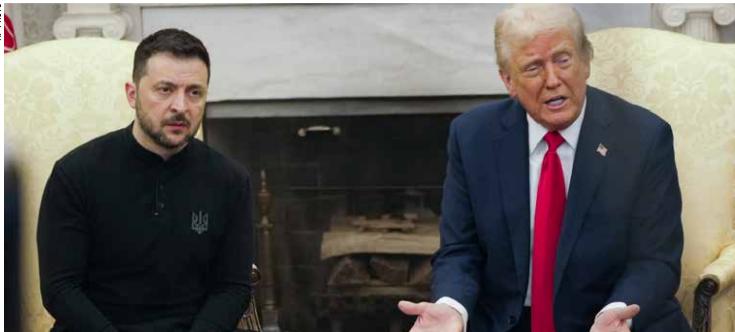
What could go wrong? Trump and Zelenskyy in the Oval Office at the White House on Feb. 28