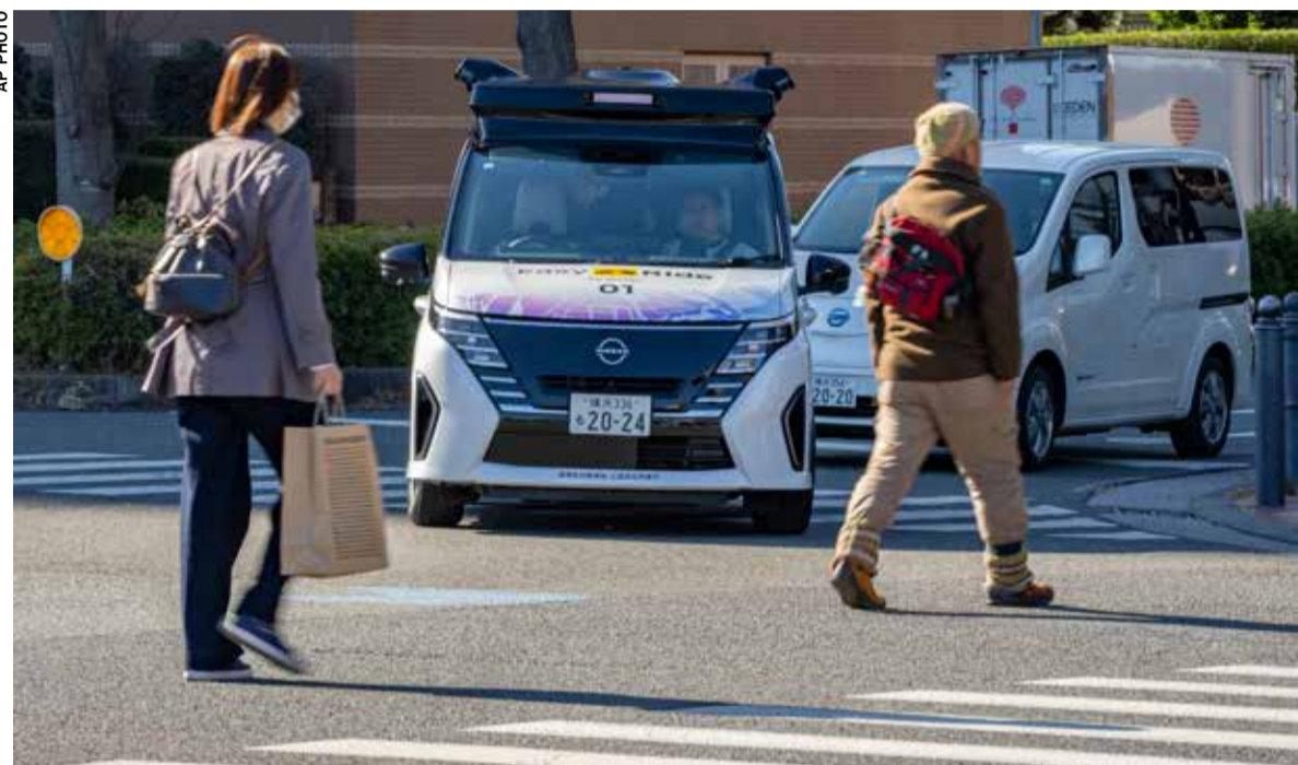
Nissan's driverless vehicle (center) drives along a street in Yokohama