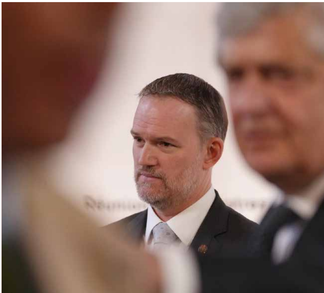
U.S. Trade Representative Jamieson Greer arrives for the G7 trade meeting in Paris, yesterday